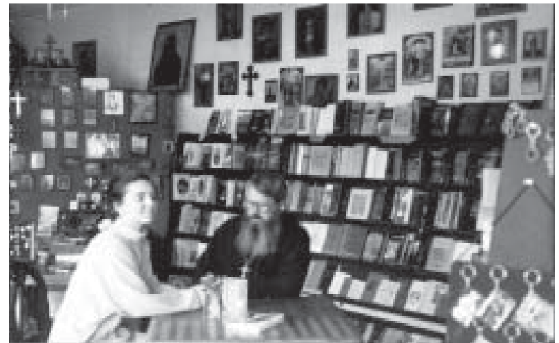
bookstore in Chico! The first thing that I saw when I went in was a book on

The next thing that really changed my understanding was the year I spent in America at Chico State University in California. The American Council of Teachers of Russian had an exchange student program, and I applied and was accepted. Although they could have sent me to any one of a number of universities around the States, I was assigned to Chico. Before going to the U.S. I went to my priest here in Moscow and asked for his blessing. I told him that just as I was getting used to church life, I was going to America, and was afraid that there wouldn't be any Orthodox contact for me there. He told me not to worry, that God would bless me and that I would find people to help me along the way. Frankly speaking, I wanted to believe him but I couldn't—it sounded too unrealistic from what I knew about the States. But just a few days after my arrival in California, I found out that there was an Orthodox