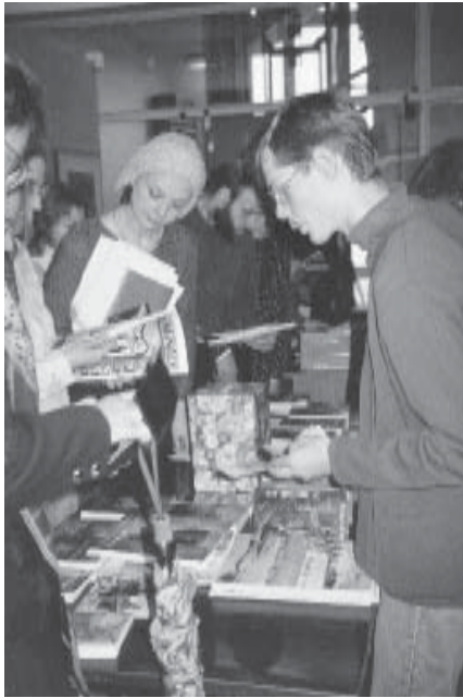
FOMA readers gather at literature table after meeting

to see us bring people together and help them find assistance in solving these problems. A good example of people already doing this is a television program here called Vzglyad (Opinion). It is not a religious program, but they try to help. Recently, for example, they showed a little boy who had no home, no parents, nothing. They didn't just run it as a tragic story, but they actively asked for people to help change the child's situation, and they did. This is the kind of thing I envisage for our journal.