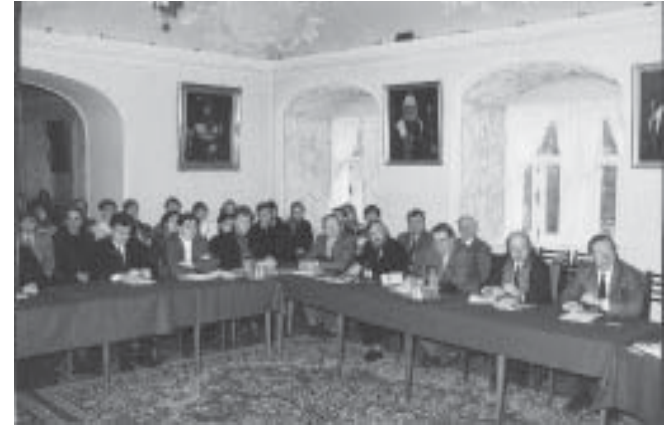
Meeting between future diplomats and seminarians at Holy Trinity-St. Sergius Lavra.