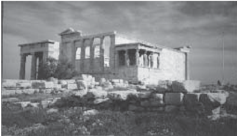
Ruins of the Erechtheum, later a Byzantine church dedicated to the Mother of God The Christian Parthenon

The Erechtheum temple sheltered a fourth statue of the goddess that commemorated her mythical victory over Poseidon, the Greek god of the sea, over whom she had won preeminence by planting an olive tree on the Acropolis. The statue was fittingly carved from olivewood. Another room of the Erechtheum was dedicated to Poseidon himself, and a third to the snake-bodied hero Erechtheus. The south side of the structure supports the famed Karyatids, six columns in the shape of women. A short distance away was the Pandroseum, or Temenos of Pandrosos, where Athena's sacred olive tree grew.