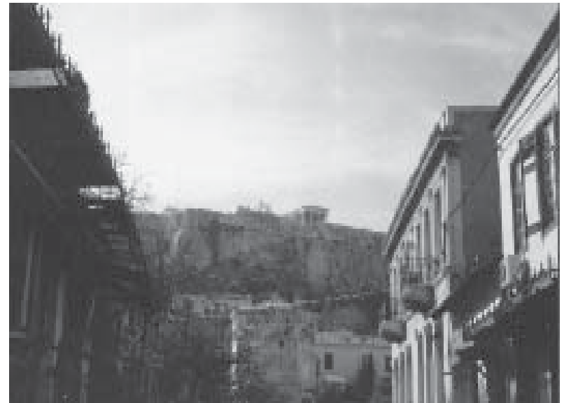
View of Acropolis and Parthenon from the Plaka in Athens

the minaret added by the Turks remained untouched by the explosion. The Greeks did not regain what was left of the Acropolis until the 1822 War of Independence.