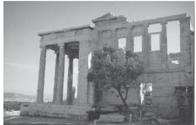
Ruins on the Acropolis with olive tree -- legendary gift of the goddess Athena to the Greek people

Byzantine Emperor Theodosius I had outlawed all forms of pagan worship and the fifth century saw the Parthenon consecrated as the Orthodox Cathedral of Hagia Sophia (Holy Wisdom). In 662 it was rededicated in honor of the Mother of God, "Panagia Atheniotissa" (Panagia of Athens), and remained so until 1204-5 when the Latins and the Franks annexed Athens. The Acropolis was then used as a fortress and palace, and the Parthenon as a Catholic