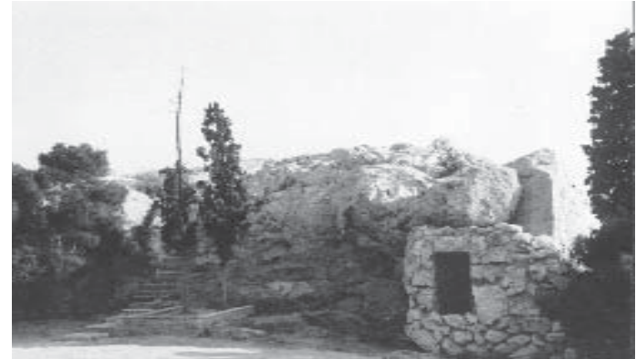
Steps leading up to the Areopagus with memorial plaque of St. Paul

For the pilgrim, the best time to sit atop the Areopagus and recall the words of the Apostle is early in the morning or late in the evening, as the sun sets behind the Acropolis with a blaze of color—the brilliant reds and golds so