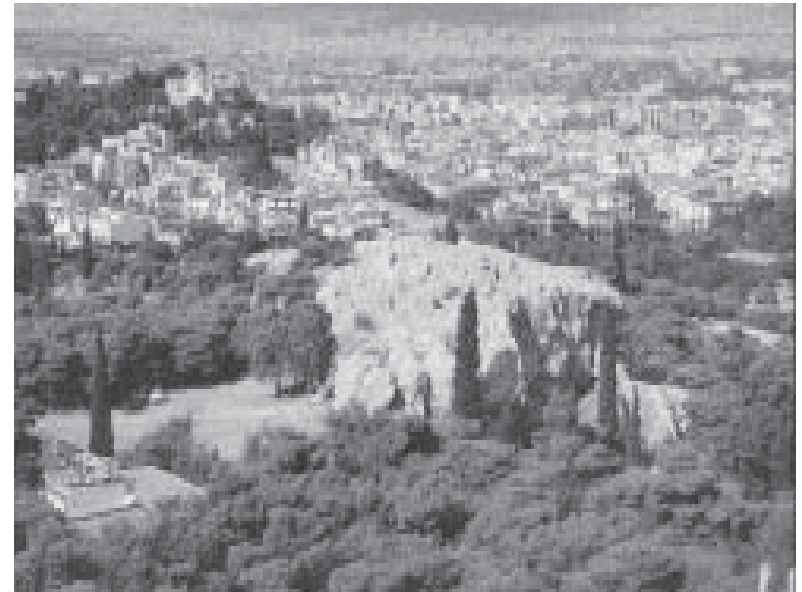
View of the Areopagus and modern Athens from the Acropolis

For Christians, St. Paul's words ring in the ears like a wake-up call, but on the day he delivered them, it may have seemed a failure, a seed dropped on rocky ground. One Parthenon historian remarks, "Intellectually sophisticated and with a keen eye for social pretensions, politically impotent, but honed to a fine edge by daily exercise in philosophical dialectic and oratorical tropes, the men of Athens whom St. Paul addressed in AD 54 must have been a formidable audience...no city resisted Christianity as long or with such a sense of intellectual superiority." 7 Out of all those thousands of worshippers, philosophers and orators, the Apostle gathered only a handful of people who believed his words. Of these we know only two by name, St. Dionysius the Areopagite, who, tradition tells us, was a judge on the nine-member council of the Areopagus, and a woman named Damaris. Little did sophisticated Athens realize that within a few hundred years these vaguely heard and quickly dismissed words would bring her speculative philosophies tumbling to dust—and the golden spear of Athena supplanted by the life-giving Cross. ✝