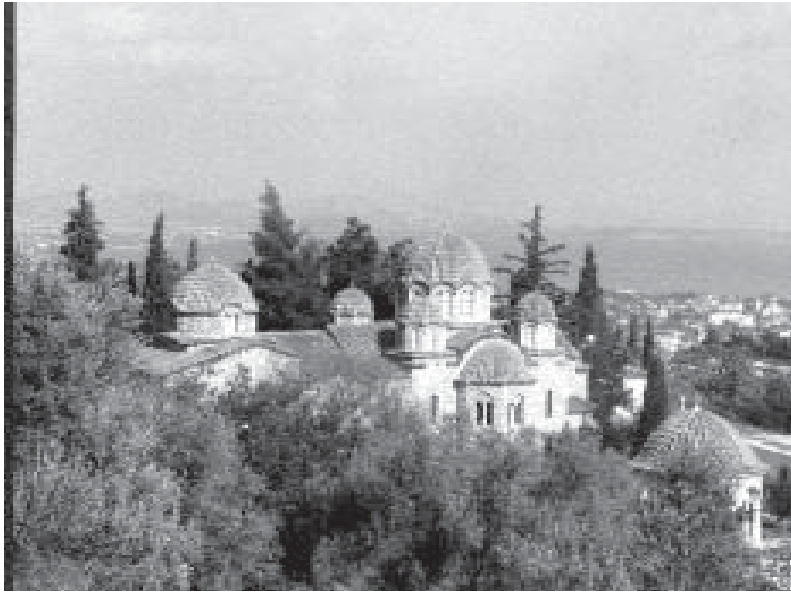
Monastery of the Annunciation of Nea Makri

driven into his hands and feet and he was pierced through the center of his body with a sharpened pole that had been fired until it was red-hot.