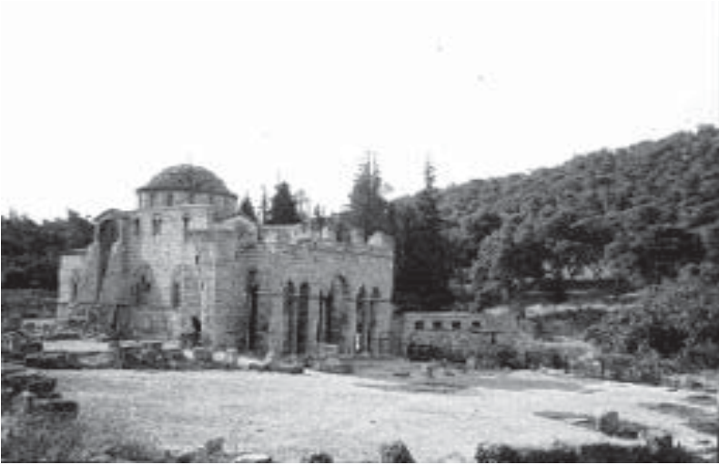
Courtyard where St. Ephraim's relics were found

Ephraim, I knew that it was he who had saved me from that terrible poison.