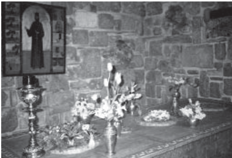
Old sepulchre of St. Ephraim in monastery church a very loud, strong voice and a frightening persuasiveness that didn't leave

Once, during that time, as I sat at home alone in a state of despair, a strange visitor whom I had never seen before appeared in front of me. He was of medium height, and had very large round eyes that kept rolling about. He had long black bushy hair on his body. Also he had horns and a tail. He had