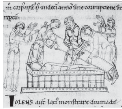
Monks find St. Cuthbert's incorrupt body

happening...people from new churches are saying, "We believe God is calling us to go back to monasticism, to be a spiritual father and to disciple others in the soil of solitude," but they don't yet have the framework in which to do this. If they can be introduced to the monastic tradition, then perhaps they can experience what is missing.