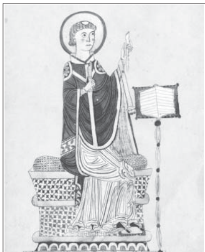
Venerable Bede sharpening his quill