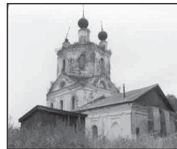
Ruined church of Archangel Michael with attached trapeza-church now being restored