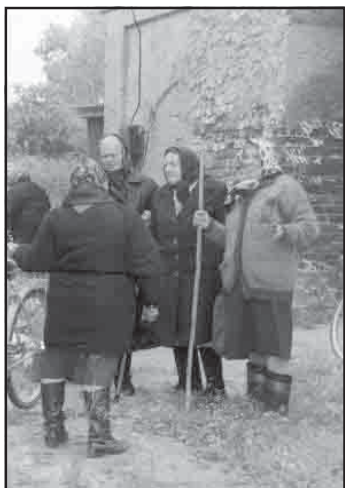
Village babushki outside church after morning service

Communion, to serve funeral and marriage services, and paint icons. "I feel so awkward," he says, "I am an ordinary man with sins and funny habits, and those who don't know anything about Christianity will judge about Christ's church by me. I only hope that God covers my imperfections with His grace. Truthfully, speaking, I'm not very afraid."