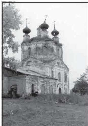
Church of Archangel Michael, Sakhulino