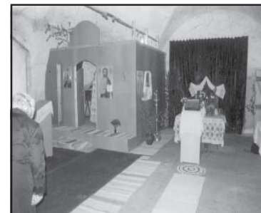
Interior Trapeza—Church of Archangel Michael under restoration