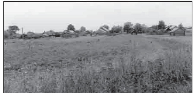
Sakbulino, Ivanovo region