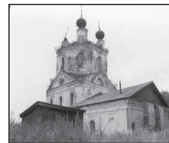
Ruined church of Archangel Michael with attached trapeza-church now being restored