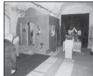
Interior Trapeza—Church of Archangel Michael under restoration