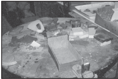
Bricks for mosaics

At first we planned the mosaic – the Crucifixion with five figures. Then I did a painted line-drawing, a cartoon, of the mosaic – it was about nine square meters. I painted the line-drawing and then bought the corresponding colors of bricks of baked clay, ceramic, and glass. The technique of mixing