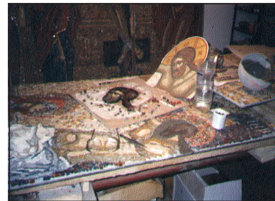
Detail of Crucifixion mosaic

For me, it is the same with Slavonic, our ancient Russian church language. I have never studied it but I understand it well. I can read books in Church Slavonic because it is my language, it lives in my genetic memory. It is absolutely my familiar native language, a special language with which we talk to God. And mosaic is the same – in working with it we reach back to something in Russia’s past that is also a part of me. Just as I remember and repeat words that were spoken by the saints and elders, when I paint a line I know that I am repeating a gesture used by our ancient Russian icon painters. I lose myself and my ego. At this moment I am not a part of my age or my century – I belong to the life of the whole Church, out of time. ✚