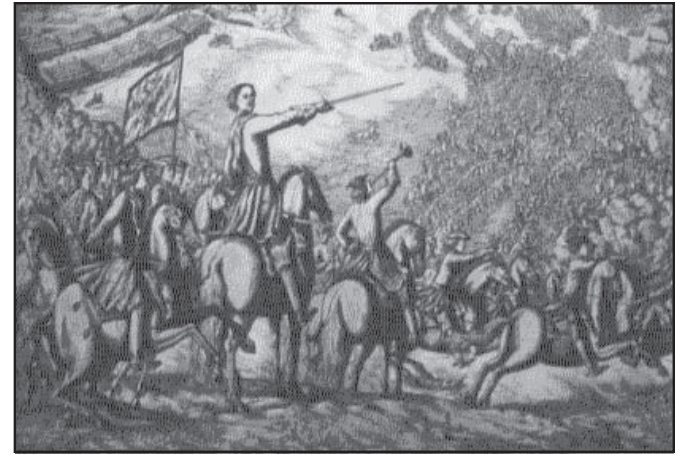
Detail of “Peter I at Battle of Poltava” engraving on metal