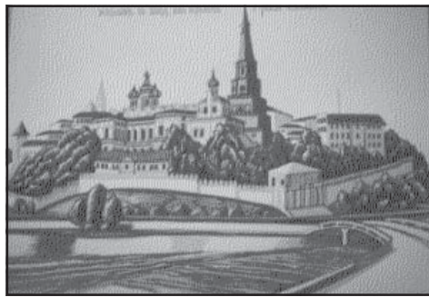
“Kazan” engraving on linoleum