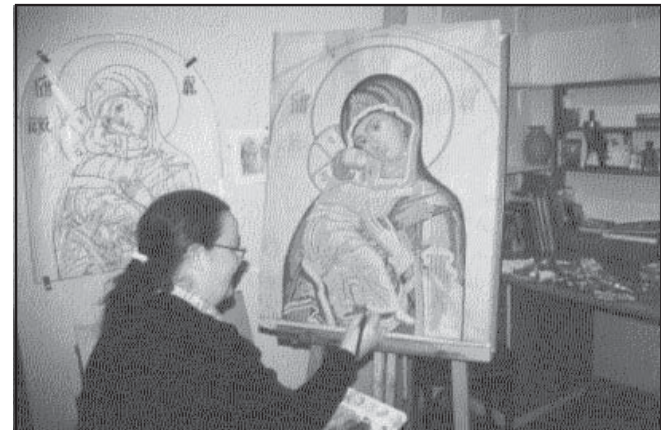
Painting cartoon for mosaic

When you've finished, you must let the work sit for awhile, so that after a few days you can look at it with fresh eyes. You always see places that aren't