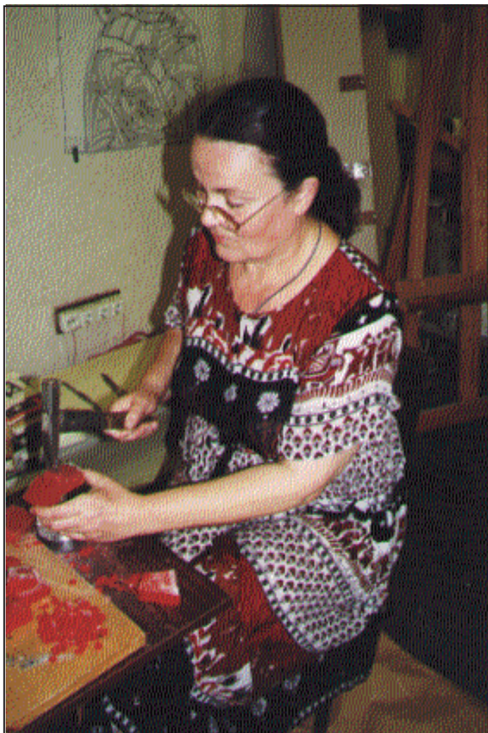
Breaking the bricks into modules