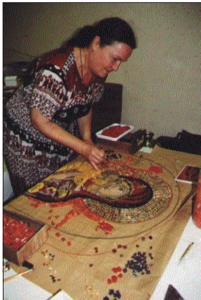
Setting the dry composition