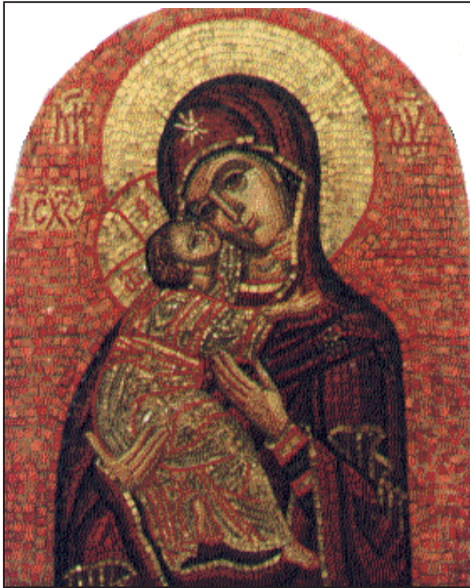
Mosaic of the Mother of God, Convent of the Glorification of the Mother of God, Borovskoe, Siberia

right in size or color so you must take your hammer again, chip them out, and redo those sections.