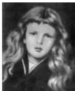
G.K. Chesterton at age 6.

"...But the best part of the tale — the account of the vacillations of the hero between the humble life to which he owes everything, and the gorgeous life from which he expects something — touches a very true and somewhat tragic part of morals; for the great paradox of morality (the paradox to which only the religions have given an adequate expression) is that the very vilest kind of fault is exactly the most easy kind. We read in books and ballads about the wild fellow who might kill a man or smoke opium, but who would