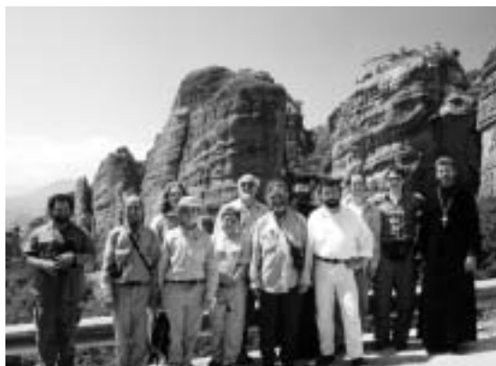
American pilgrims at Meteora.

I visited Estonia twice afterwards, in 1994 and 1998, and got to know many priests and parishes.