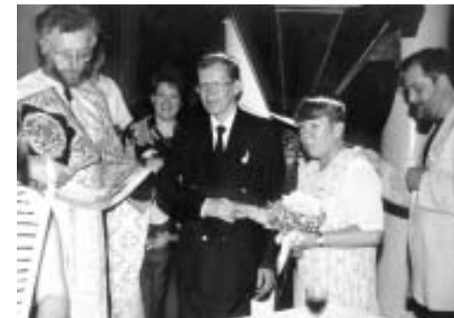
Orthodox Finnish wedding in Athens.