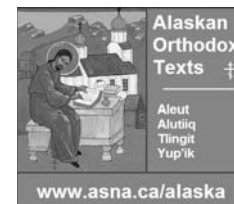
Official emblem of the historic Alaskan Orthodox Texts project.