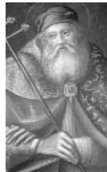
St. Gregory the Great.

There were also theological exiles in Rome from the East. In his attempts to reconcile the Monophysite Christians of Egypt and gain their support in his conflicts with the Persians and Arabs, Emperor Heraclius involved himself in theology by attempting to impose an unorthodox, compromise doctrine known as Monothelism 2 on the Church. He persecuted the doctrine's opponents, such as the great theologian of the seventh century, Maximus the Confessor, and many of them also made their way to Rome. The Lateran Council of 649 in Rome dealt with the question of Monothelism, which was condemned in 681 in Constantinople by the Sixth Ecumenical Council.