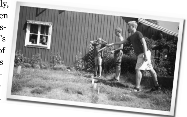
Playing Swedish game of Kubb with friends, 2001.

Nowadays, Finland has become too rich and too comfortable. People have money for everything, but many of them no longer come together as a family. Today real family life is often found only in the countryside. In the cities, people don't have time to talk things over, to be family, just to eat together – even if you don't talk. And Russian Karelia, my father's homeland, is now full of people who have no roots and no sense of themselves – they were simply moved there from