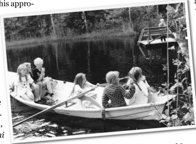
Above: With friends on the pond, 1993. Below: Cousins diving off the pier, early 1990s.

My father's parents died when I was quite young, about 11 or 12. My grandfather was 94 and my grandmother 85. As my