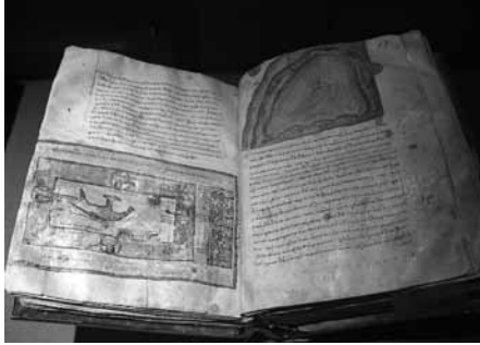
Illuminated manuscript in the library of St. Catherine's Monastery.

two preeminent manuscripts of the New Testament, so much so, that if the Codex Sinaiticus and Codex Vaticanus agreed on a reading, one could set aside the rest of the manuscript tradition. They were that important. Scholars today would be much more cautious about taking the whole of the evidence into account, but the Codex Sinaiticus and Codex Vaticanus are still extremely important for people studying the text, especially of the New Testament, but also the Greek Old Testament as well.