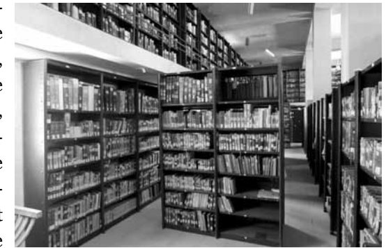
Wide angle view of the library, manuscripts above, early printed books below.

I became the librarian, photographing the manuscripts