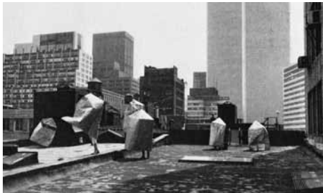
Population X: Street Art in New York, 1987.

I was limping along financially, so I went to work for Hospital Audiences (HAI), an organization that sends artists, actors, and musicians to over 250 sites in the New York area to work with the mentally ill and the homeless. I ended up in Harlem, at an adult psychiatric rehabilitation center called Community Support System (CSS), a haven for people with psychological challenges. From the moment I arrived, I sensed that something major was about to shift in my life. As I was getting oriented, a client poked his head through the open door—actually he was leaning diagonally across the door-