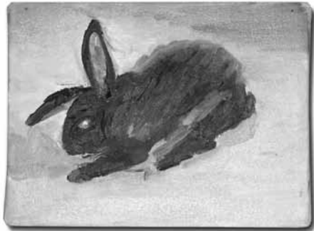
Jack the rabbit, by a workshop client.

Animals have always been a part of our workshop. Initially, we had an aviary with songbirds designed by my son, and later, cages of gerbils, three red gliders in a huge aquarium, a silver-haired rabbit and Ballerina, the studio cat. Often our clients have had negative childhood experiences with animals, so our animals are doubly therapeutic for them. Jack, our rabbit, lived for twelve years and hopped around at will in our huge space. He was eulogized