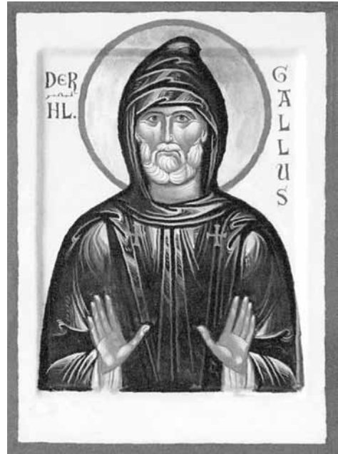
The Irish missionary St. Gall, Enlightener of Switzerland. Icon from St. Spyridon Skete.

it still has ten Romanesque churches! 2 Until the end of the twelfth century, the spiritual center of Cologne was the St. Gereon Church where relics of martyrs of the Theban Legion 3 are still honored, and before which several