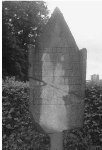
4th-century Roman gravestone showing Christian and pagan elements. Kaiseraugst, Switzerland.

In addition to this sampling of “perfect” places, in some places you can go into a crypt, treasury or other special shrine if you make arrangements in advance. In many places the relics which are usually in safekeeping are brought out in procession and for veneration on the saint’s feast day. Other places, such as the town of Scheer, have shown that it is possible to keep their treasures safe and still provide for everyday devotion. There, they have beautiful duplicates in the church of the three reliquaries for the Anglo-Saxon sibling saints which they possess. The relics, however, are in a room directly behind the wall in their original reliquaries. The originals are brought out on their feast days.