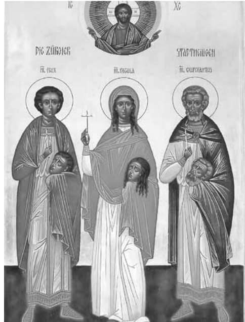
Patron Saints of Zürich, Switzerland. Icon presented to the Grossmünster (Great Minster) by the Orthodox Clergy.