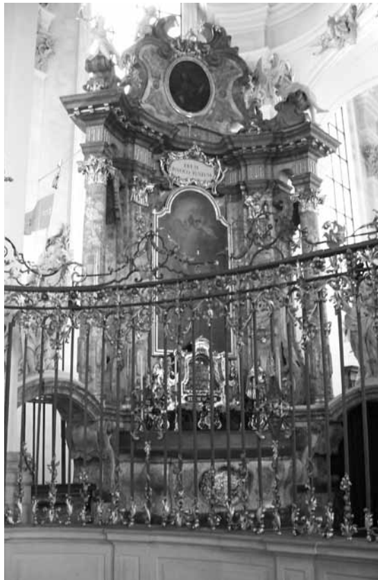
Relics of Sts. Gall, Otmar, and other saints behind ironwork in Cathedral of St. Gall, St. Gallen, Switzerland.

For example, in Bregenz (now Austria) we can trace the replacement of Christianity by pagan worship. When missionaries arrived there two centuries after the Roman troops had left, they found a church that was previously dedicated