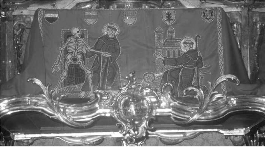
St. Fridolin's shrine: legend of raising the dead man Urs. Bad Säckingen, Germany.