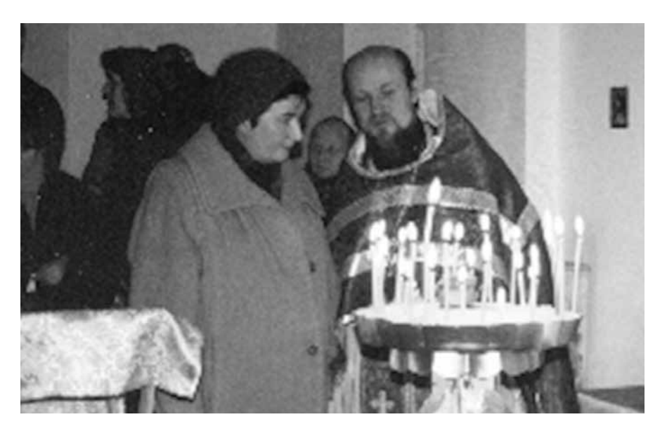
Priest hearing confessions at a Moscow church.

that three Sunday liturgies completely change the way a person feels about the world. Church Slavonic, hitherto difficult to understand, becomes completely transparent – Church singing becomes intelligible. The soul is invisibly nourished by God's grace and, freed from deadly passions and sinful thoughts, it opens up like a flower under the warm rays of the sun.