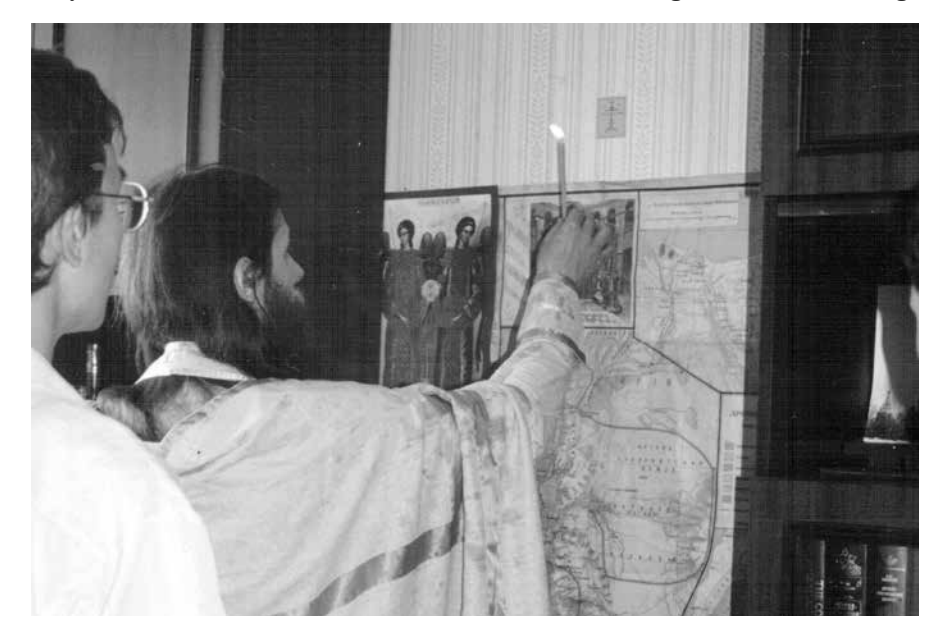
Blessing an apartment in Moscow.

In our journalism class we were given an assignment to write about a recent event in our life – something that really made an impression. Many students wrote about their friends, birthdays they attended, summer holidays. I wrote about how I was the bridesmaid at a girlfriend's wedding.