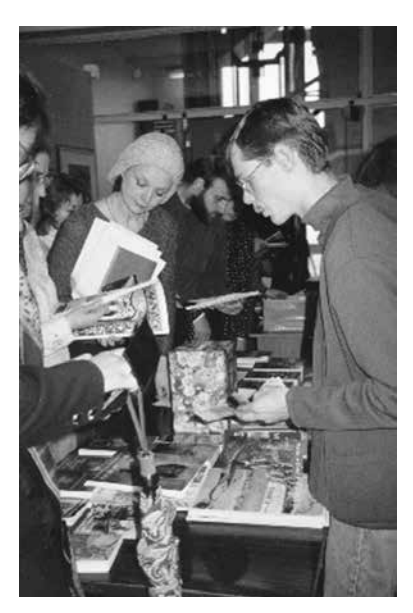
FOMA readers gather at literature table after meeting.

Also, we have to look at going beyond our magazine in practical ways. For example, one Orthodox editor was speaking to me of journals that come out strongly against abortion. Her comment was, "I don't think they should write articles like that. If you write and say it is a terrible sin, then it means that you