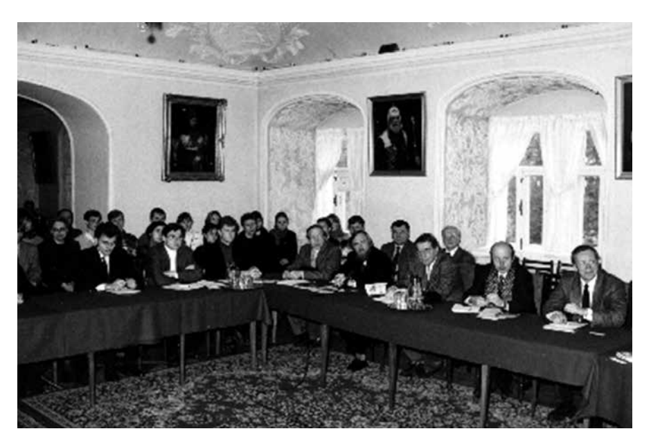
Meeting between future diplomats and seminarians at Holy Trinity-St. Sergius Lavra. a tragic story, but they actively asked for people to help change the child's situation, and they did. This is the kind of thing I envisage for our journal.

RTE: Foma hits at the level of the mind and heart. Do you think it also affects souls?