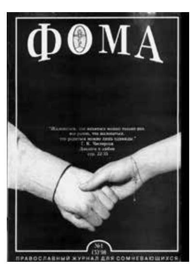
Early FOMA cover.

We also try to avoid any mentor-type preaching in our articles. Our journal is an attempt at dialogue. It's not a monologue; it's a dialogue. Also, our articles are not just about church life, they are also about everyday things in general: about life and death, suffering, if God is love why do people go to hell, etc. This helps people to think about Christianity.