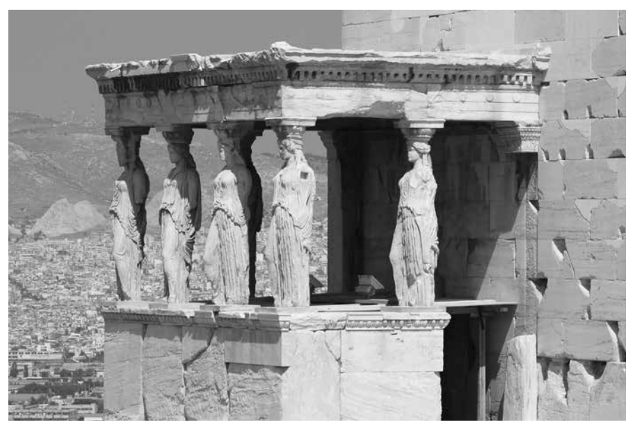
The Caryatid Porch of the Erechtheion, later a Byzantine Church dedicated to the Mother of God