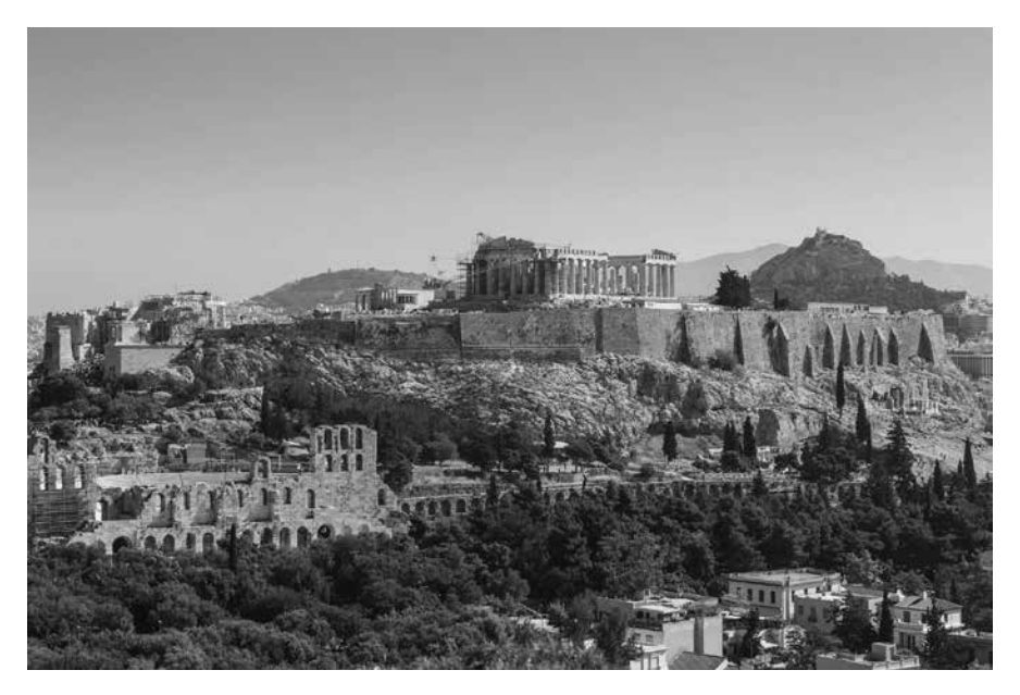
View of the south slope of the Acropolis.

proceeds of the spoils taken after an Athenian victory over the invading Persians. Also by Pheidias, the colossal bronze figure rose thirty feet from the bottom of the pedestal. Sunlight shining off the tip of Athena's spear could be seen by mariners off the Sunium coast, the southern-most point of Attica. Included in the Acropolis complex was the beautiful Propylea, the ancient entrance to the temple site; the smaller temple of Athena Nike, called "the jewel of Greek architecture," supported with ionic columns and housing another statue of Athena; and the Erechtheion, a bi-level structure that contained several shrines and the beautiful statues of the caryatids – marble maidens who upheld the south porch.