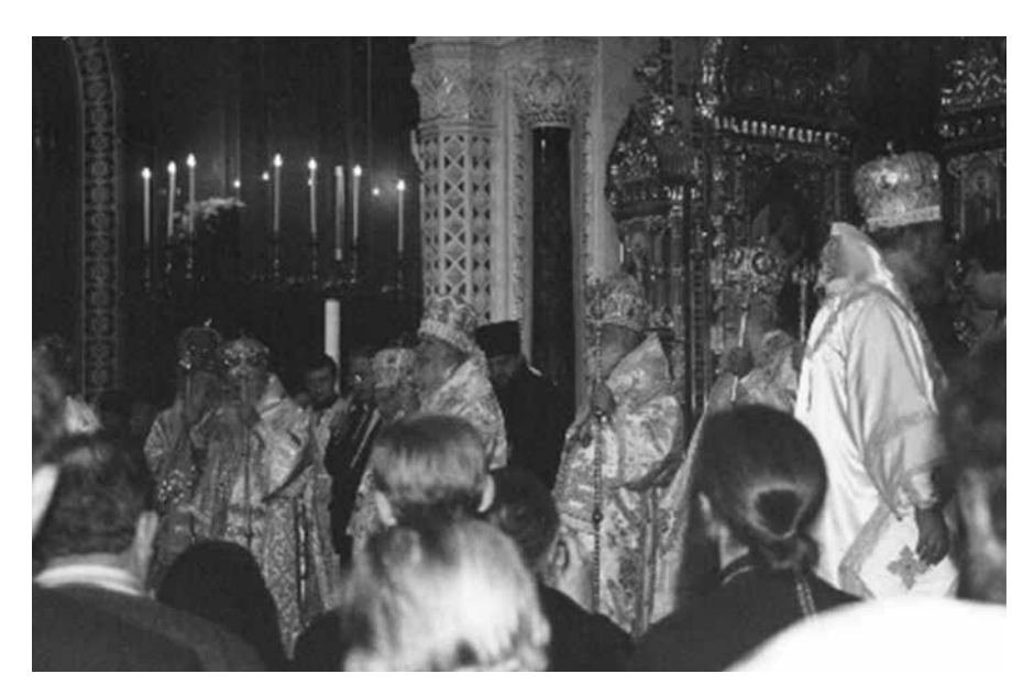
Patriarchs and Bishops glorifying the New Martyrs.

Gospel. In the suffering borne by the imprisoned Royal Family with humility, patience, and meekness in their deaths as martyrs in Ekaterinburg on the night of 417 July 1918, was manifested the light of the faith of Christ that conquers evil."