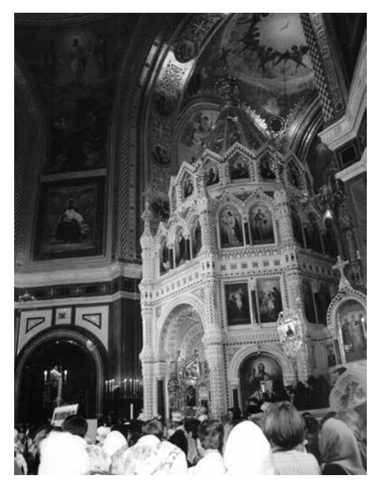
Inside Christ the Saviour Cathedral during the Glorification of the New Martyrs.

morning. Saturday morning was warm and sunny, and by 7:00 am thousands of people had arrived at their meeting points for the cross procession near the Cathedral – old, bent Orthodox babushki, students, business people, families with young children, priests, deacons and accolvtes from most of Moscow's parishes. In honor of the army's role in the century-old defeat of Napoleon, the streets leading to the cathedral were lined with military honor guards from many Russian regiments. The processions began at 8:30 am as the Orthodox wound their way to the church singing troparions to the new