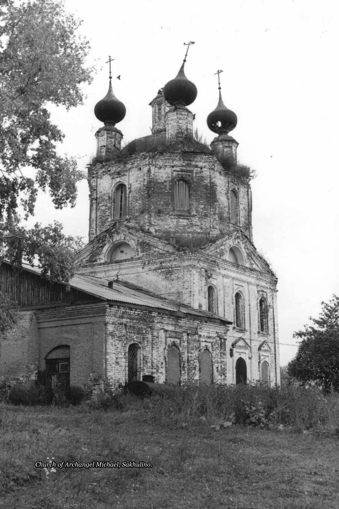
Church of Archangel Michael, Sakhulino.