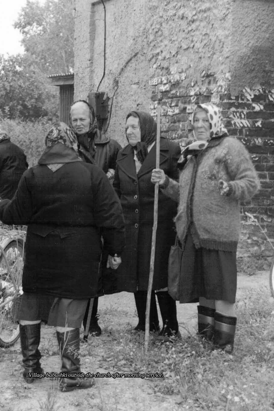
Village babushki outside the church after morning service.