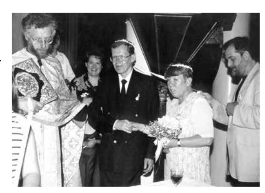
Orthodox Finnish wedding in Athens.

chandise from us, and someone else in England with a $1,000 debt. We face continual financial problems, lack of capital, and a lack of support for new businesses from the Greek state, but I decided to take this path — and even resigned as the creative director of an advertising agency to do so, because I realized that I would go crazy if I worked at