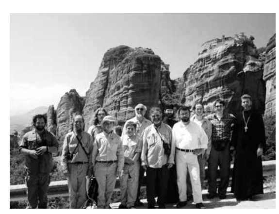
American pilgrims at Meteora.

I visited Estonia twice afterwards, in 1994 and 1998, and got to know many priests and parishes. Later, two Estonian priests asked me to help them organize a pilgrimage to Greece with their parishioners. The same