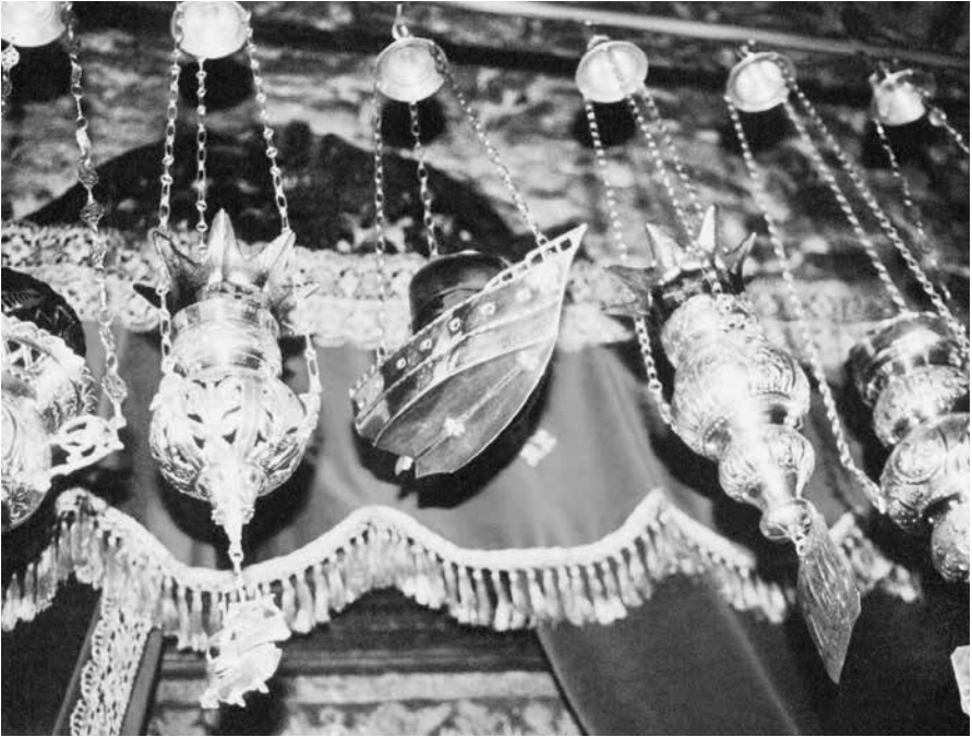
Silver lampadas and boat given in thanks for answered prayers.