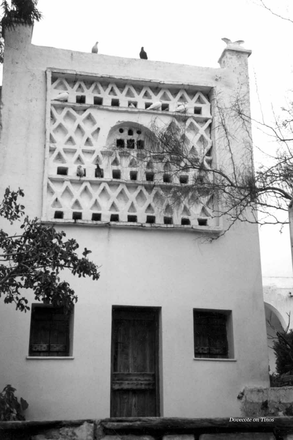
Dovecote on Tinos