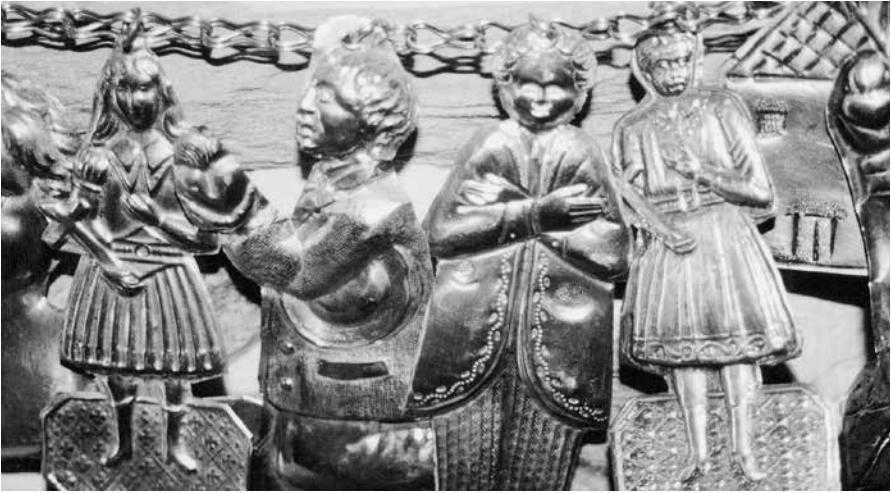
Late 19th century silver Greek figures offered as symbols of thanks for answered prayers for healing or help. Here are figures of children and adults.

ple accompanied it from the port to the palace. The king, who had been unconscious with a high fever, slowly became conscious of the blessing that had come to him and asked with trembling lips to kiss the icon. From that moment the illness began to recede and within a few days the king was healthy again. He expressed his gratitude by presenting a golden plaque on which he is depicted on horseback. The offering is affixed to the wooden kneeler near the icon.