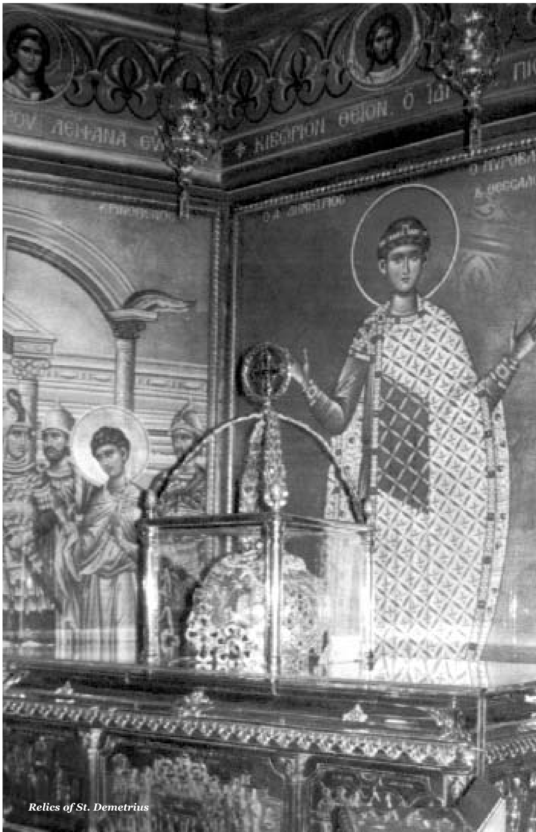
Relics of St. Demetrius

HERMAN: In Greece, the weight and richness of such a long history and tradition is almost too much, it becomes a burden and sometimes people just want to forget it. "It's just part of being Greek."