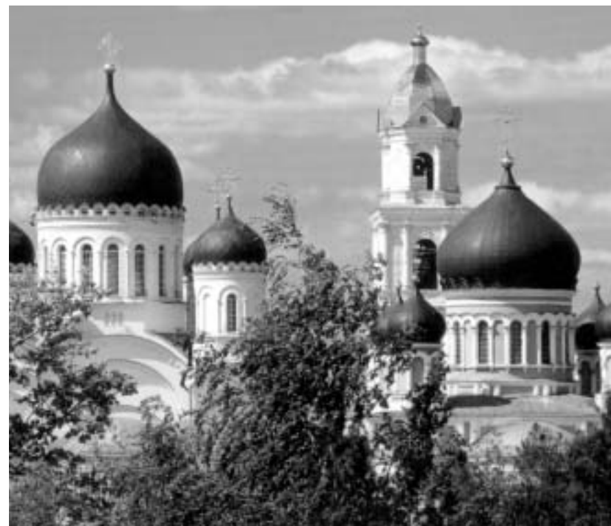
Holy Trinity Church

After Diveyevo's morning liturgy, the daily akathist is sung to St. Seraphim. Pilgrims are here from all over Russia (and the world) and it is difficult to imagine a more heartfelt and unified prayer. The slow, flowing Russian melody, fervent pilgrims kneeling on the stone floor, the rich smell of incense, and the presence of the saint himself, is an unforgettable experience.