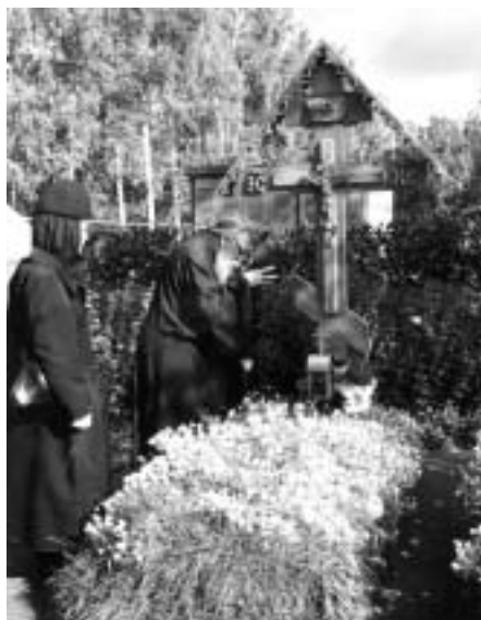
Pilgrims at Diveyevo grave.

Russian royal family shortly before her death in 1915 by throwing down their portraits from her wall, telling her cell attendant to remove the shattered glass and torn pictures to the attic. Those present were shocked, but only a few years later her action was widely understood.