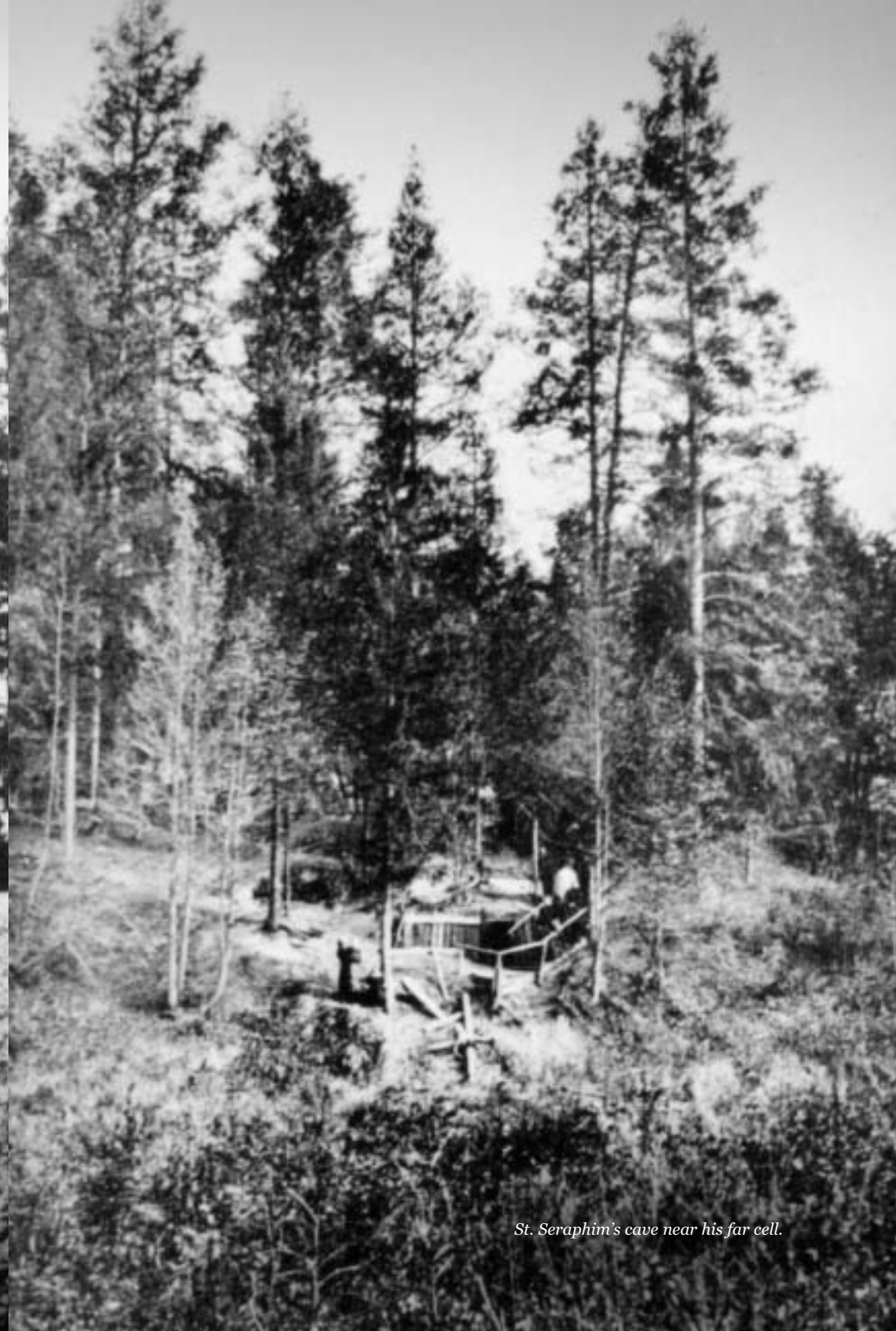
St. Seraphim's cave near his far cell.