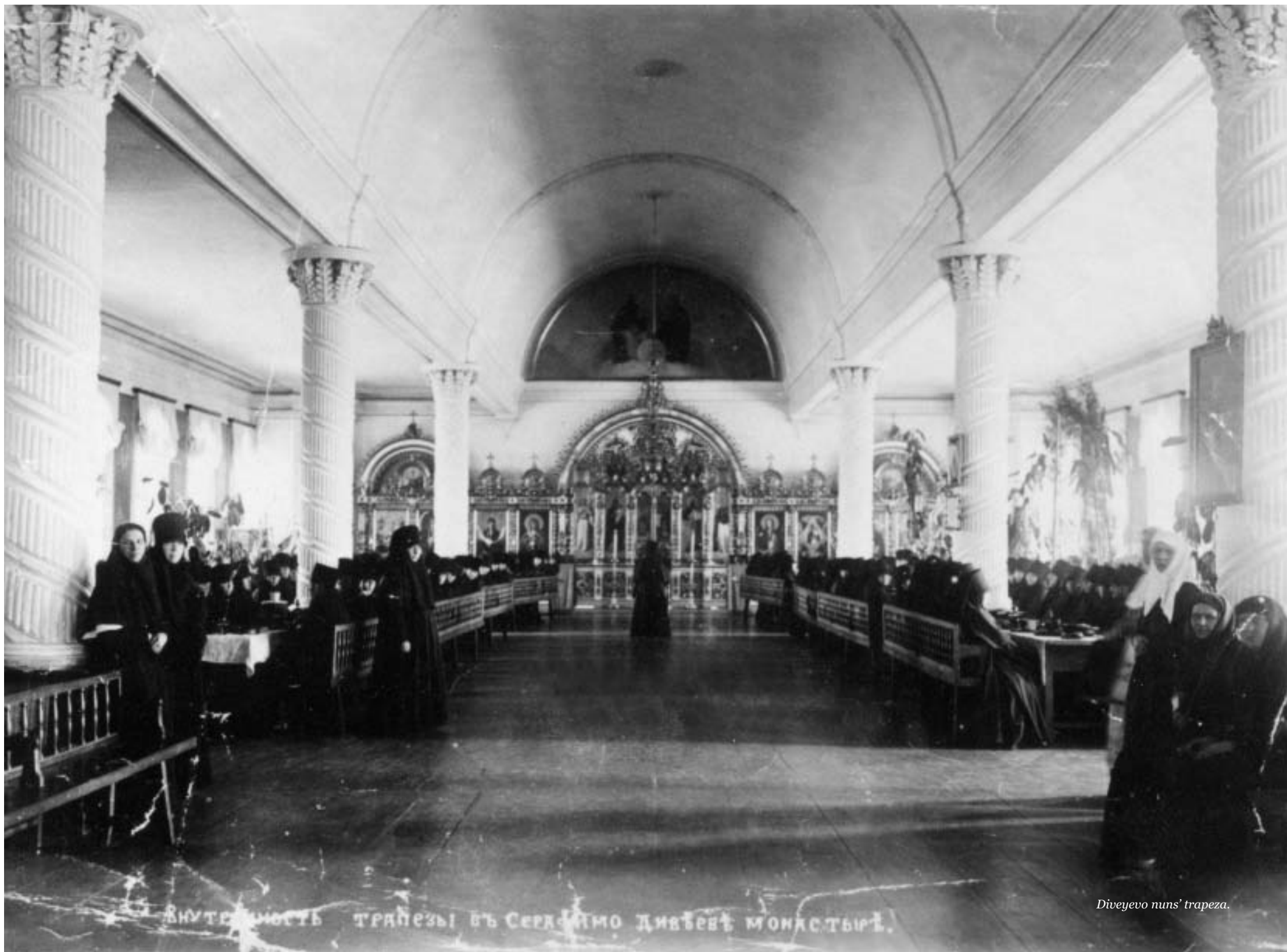
Внутренность трапезы въ Серфимовъ Дивеевѣ монастырѣ.