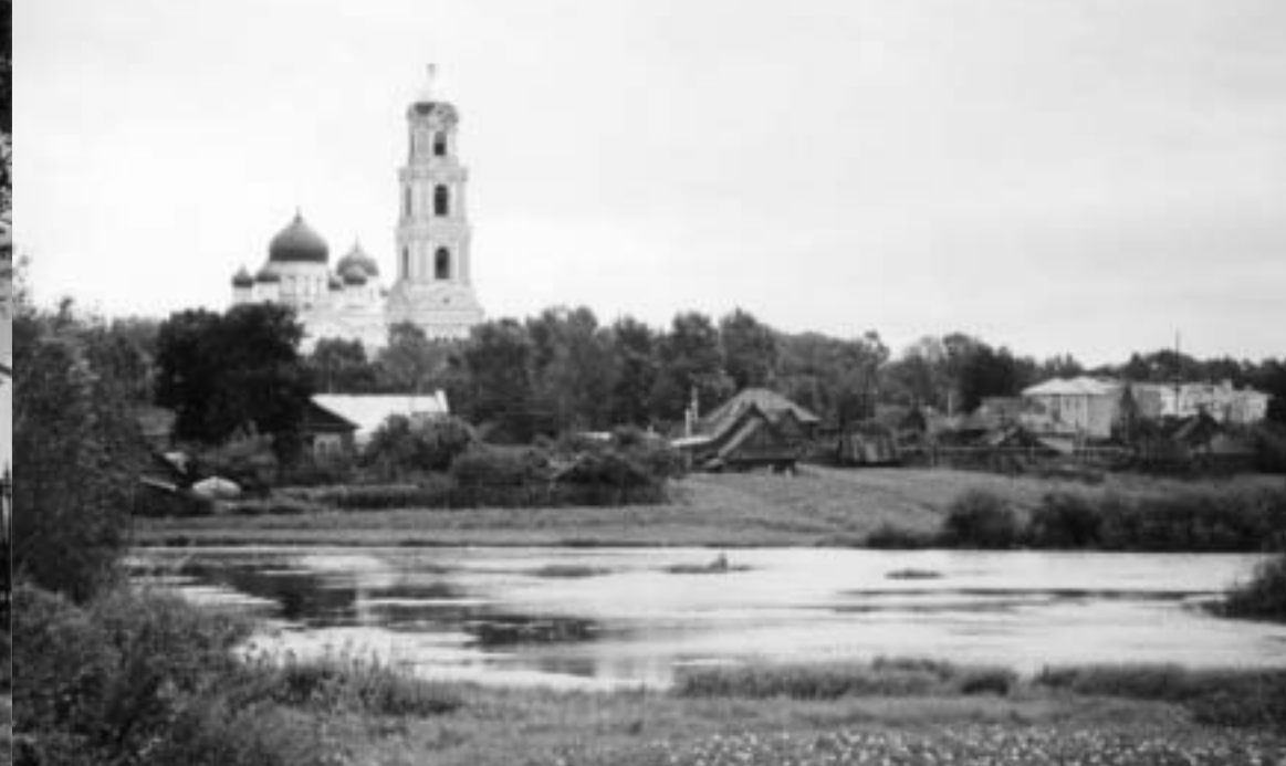
Diveyevo Monastery from the village.

It is not only the elderly who come to Diveyevo. Many pious young Russians