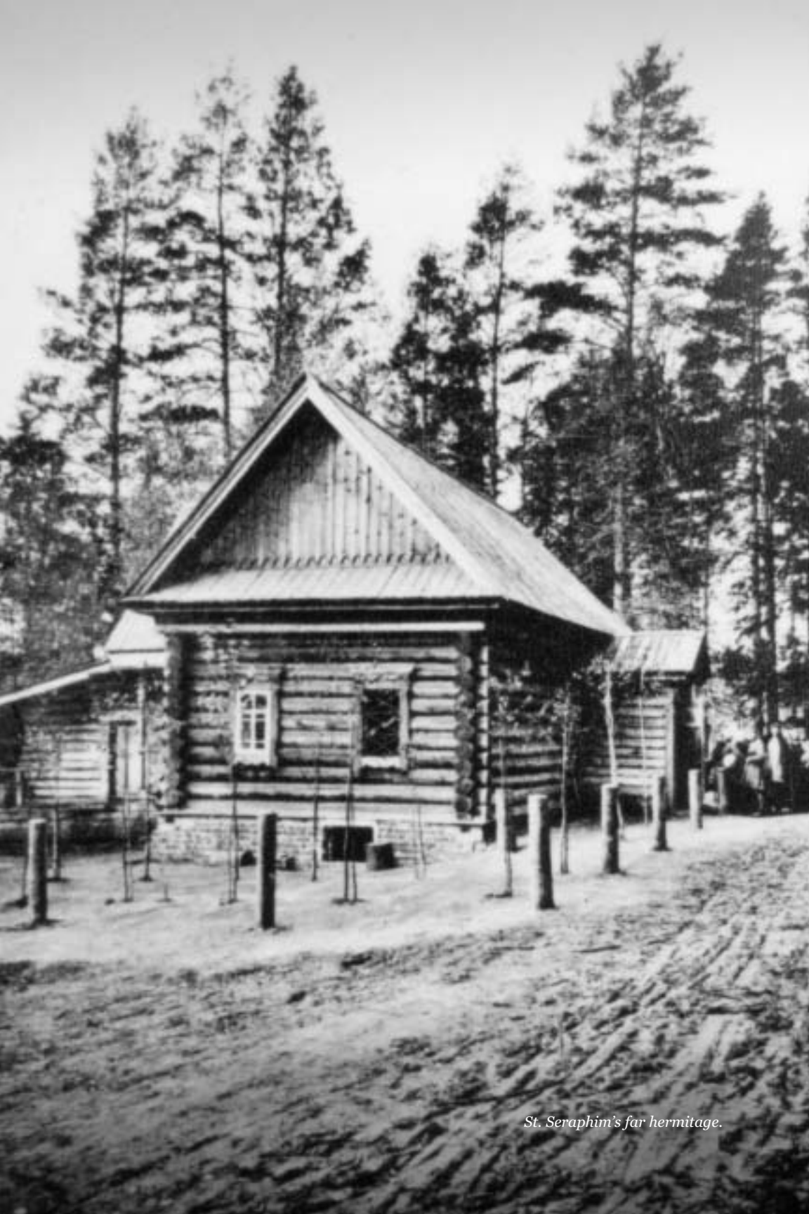
St. Seraphim's far hermitage.