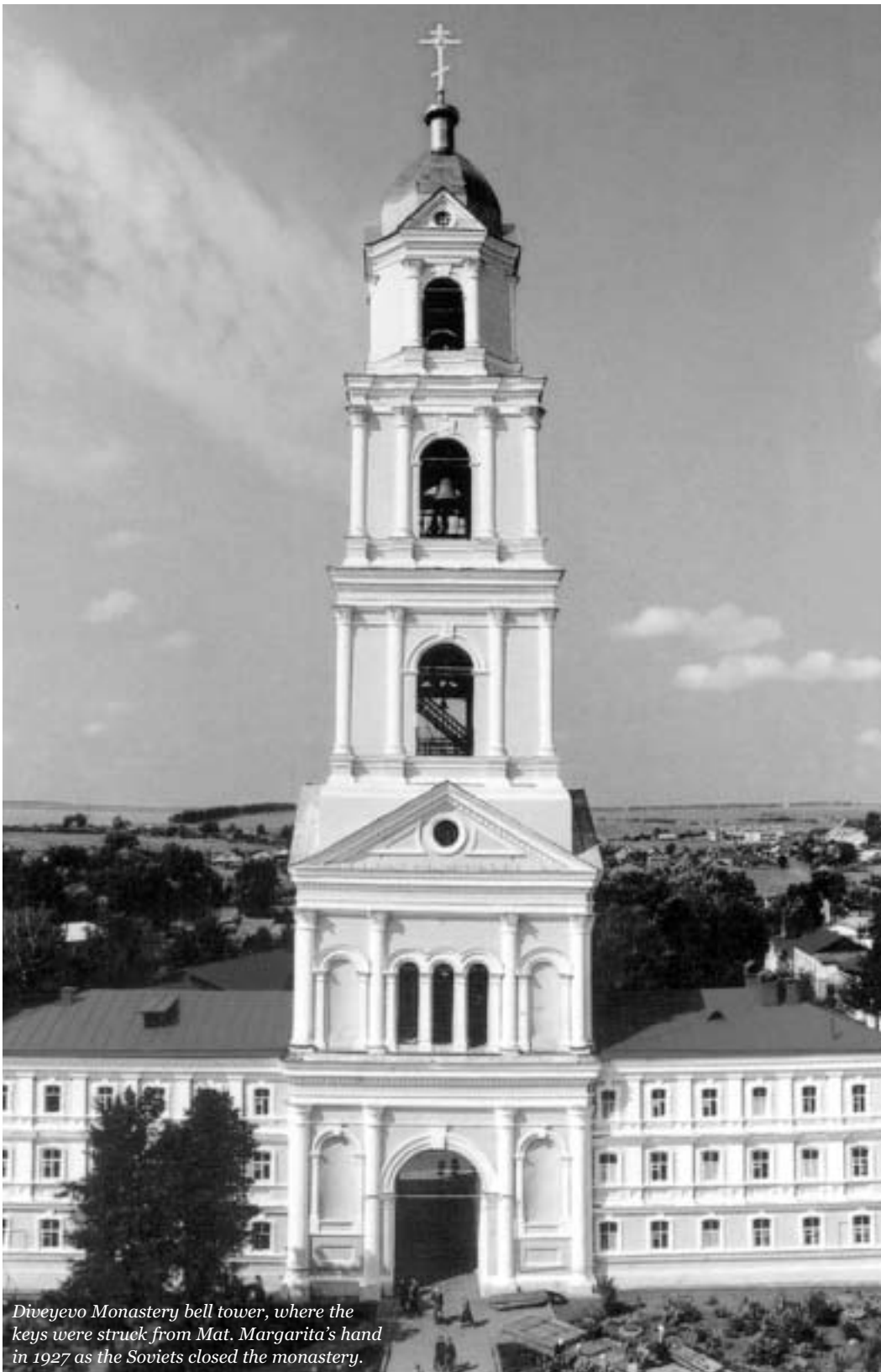
Diveyevo Monastery bell tower, where the keys were struck from Mat. Margarita's hand in 1927 as the Soviets closed the monastery.