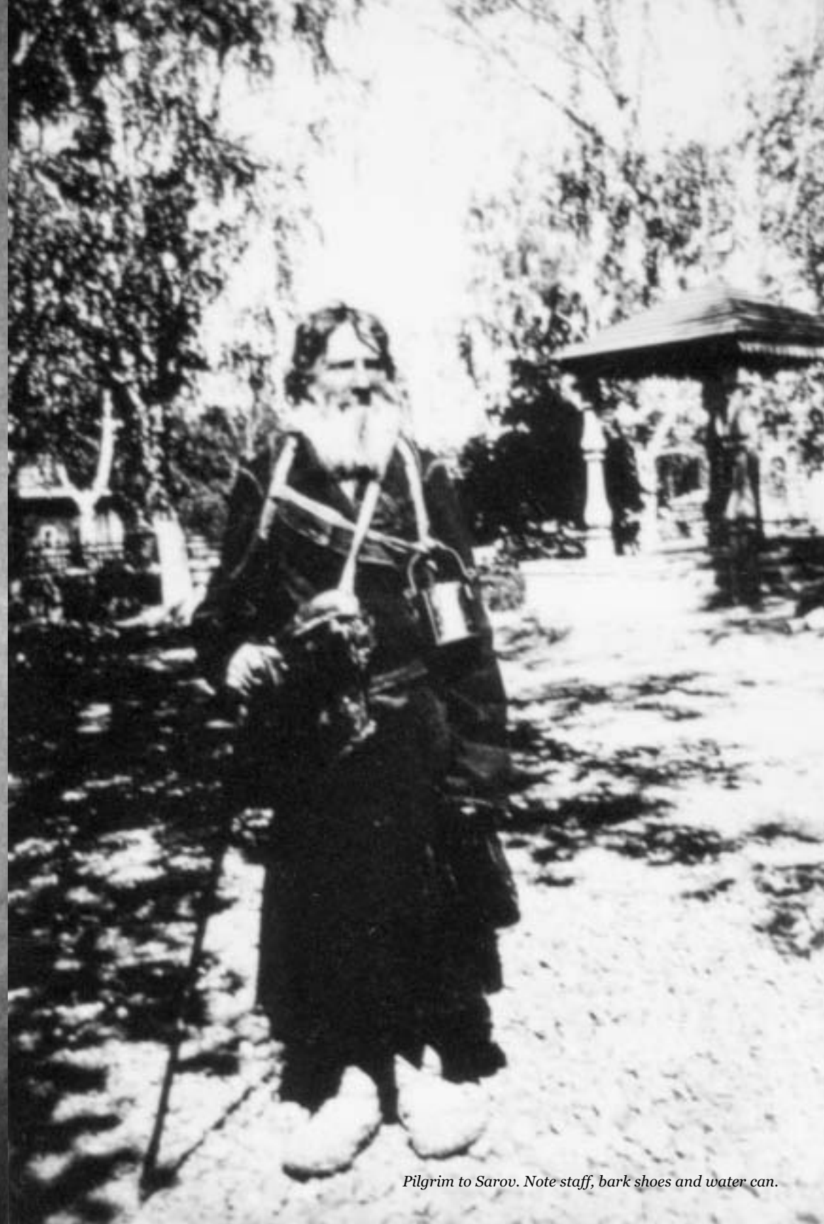
Pilgrim to Sarov. Note staff, bark shoes and water can.