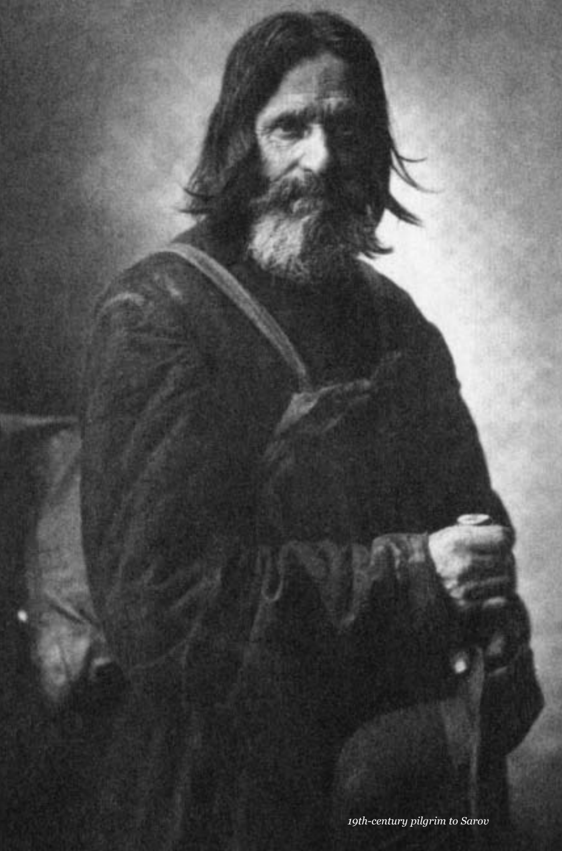
19th-century pilgrim to Sarov