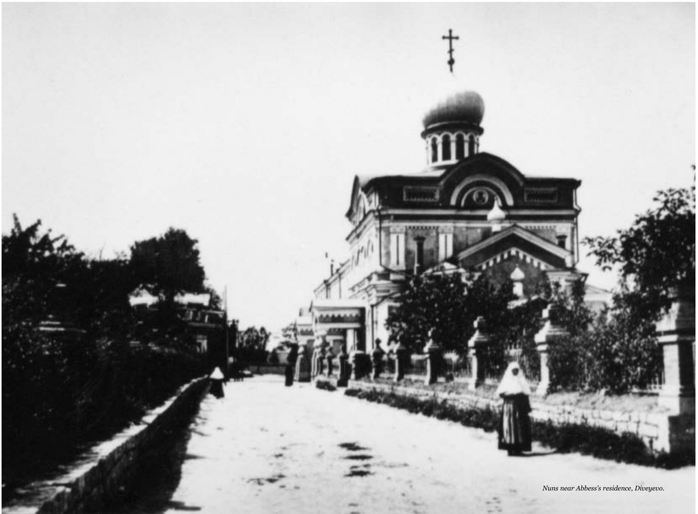
Nuns near Abbess's residence, Diveyevo.