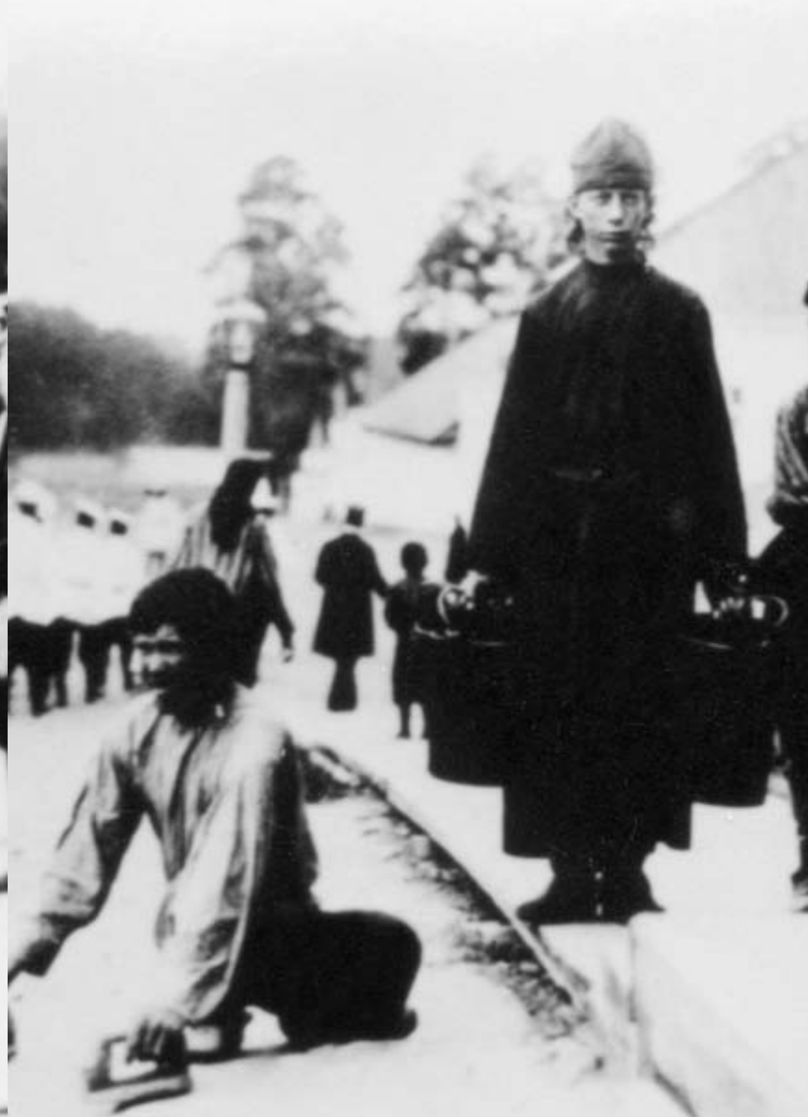
Pilgrims at the canonization, Sarov.