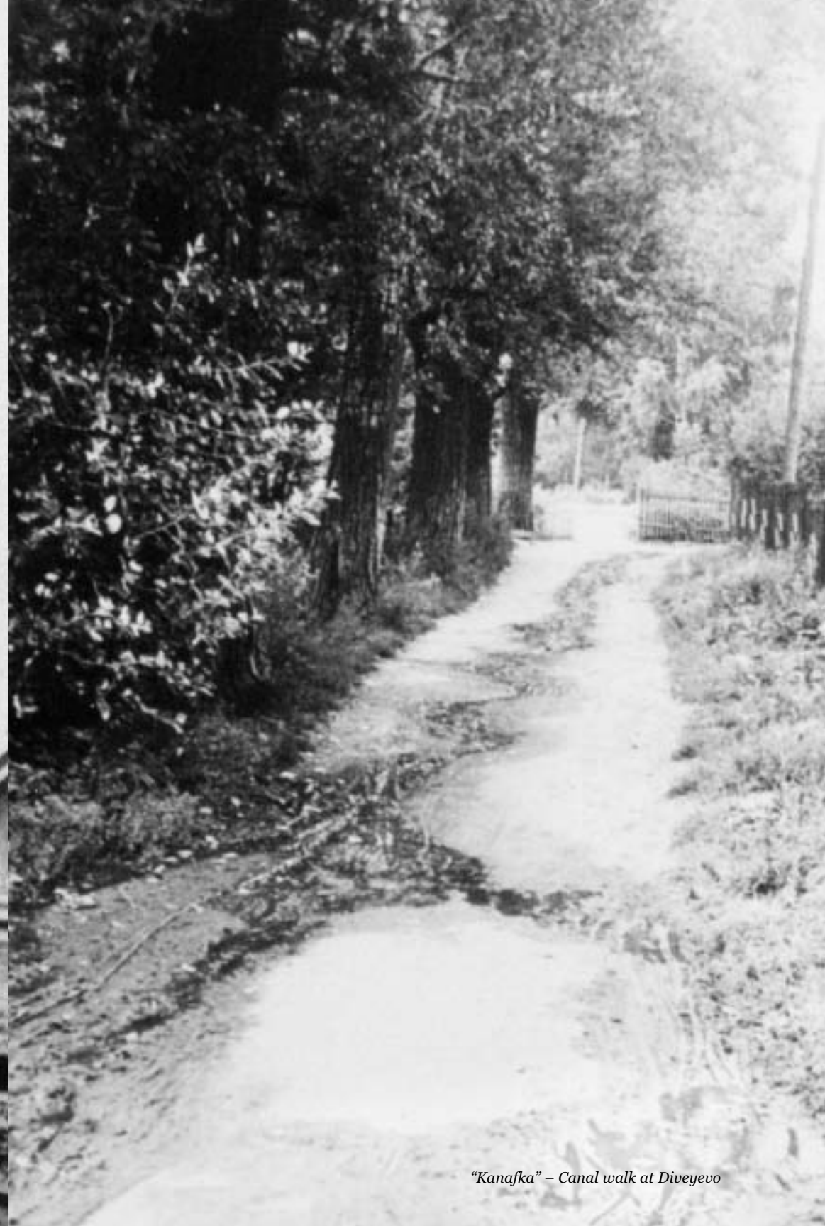
"Kanafka" – Canal walk at Diveyevo