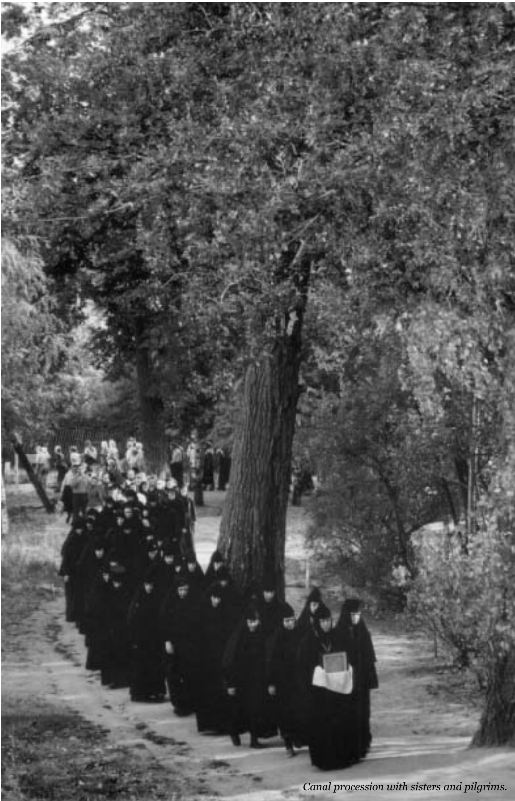
Canal procession with sisters and pilgrims.

Like many of the pilgrims, I walked around the canal path several times the first day I arrived. Every night after dinner, the Diveyevo nuns walk the canal in procession, carrying a cross and icons of the Mother of God and St. Seraphim, often with several hundred pilgrims in their wake. The day I arrived it had been raining for many weeks, and the well-worn clay earth was a slippery mire, especially where the canal path had worn smooth. There are many gullies, remnants of the old canal, where one has to clamber down small ravines. I did not have the compulsory rubber boots and as the soles of