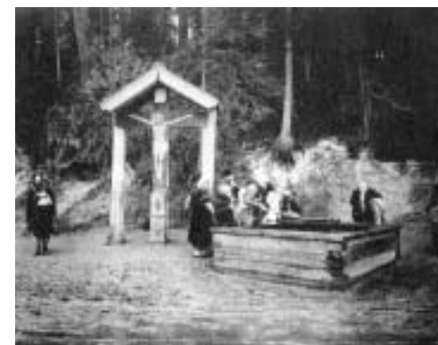
Pilgrims at original spring of St. Seraphim in the Sarov woods, circa 1900.

appear at night inside the forested military zone between Sarov and Diveyevo. He was seen by many of the soldiers who reported being approached by an old man in a white robe with a staff. Shouting at him to halt, they shot at close range but the bullets never touched him. This became such a common occurrence that when a shaken new recruit came to report his first sighting to his superiors, he was simply told to forget it.