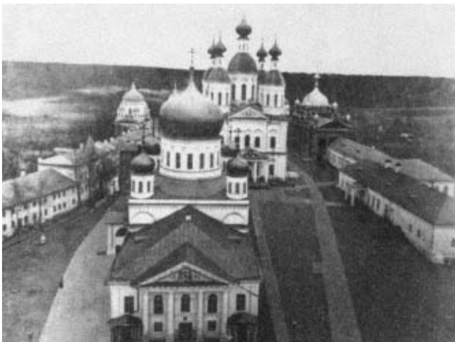
Sarov Monastery, early 20th century.