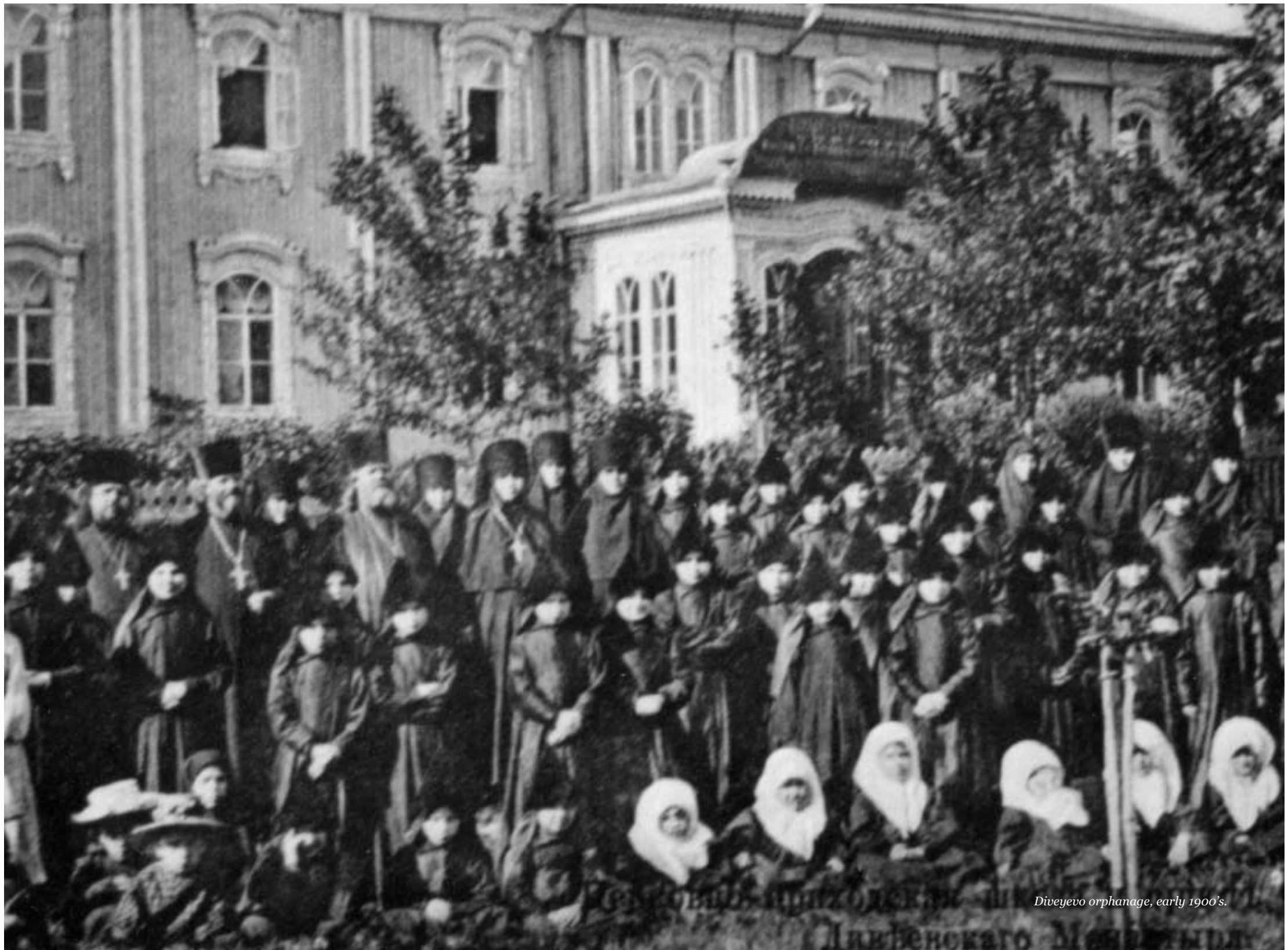
Divejevo orphanage, early 1900's.