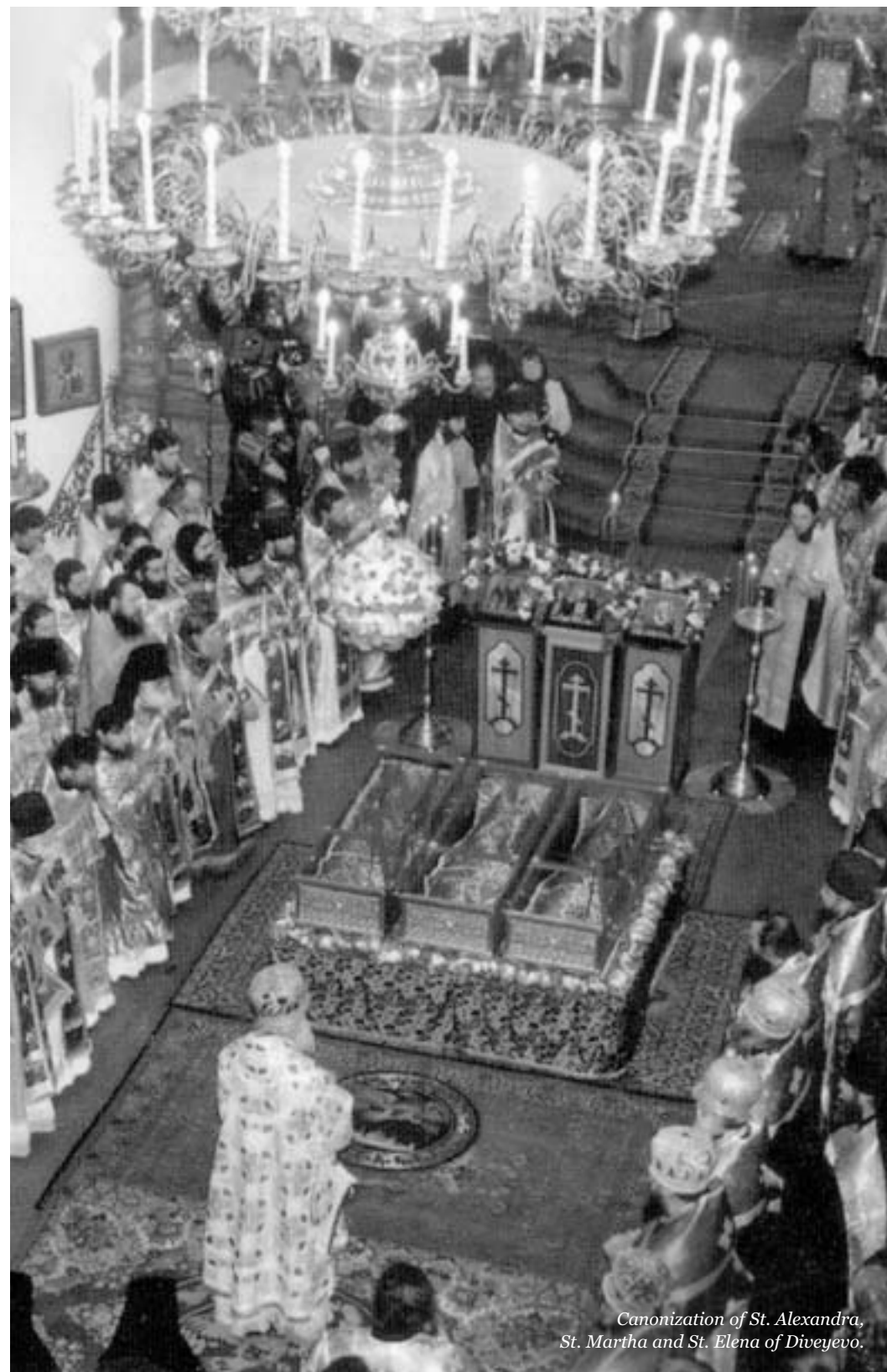
Canonization of St. Alexandra, St. Martha and St. Elena of Diveyevo.

A decade later, Diveyevo Monastery has been impressively rebuilt. Sadly, much village land formerly belonging to the monastery still has not been given back, but the beautiful old trapeza-church of St. Alexander Nevsky, for many years a movie theater and disco, was returned and is now being restored. Behind the Church of the Holy Trinity, which enshrines St. Seraphim’s relics, stands the massive Church of the Transfiguration, unfinished even at the time of the monastery’s closing in 1927. Work has