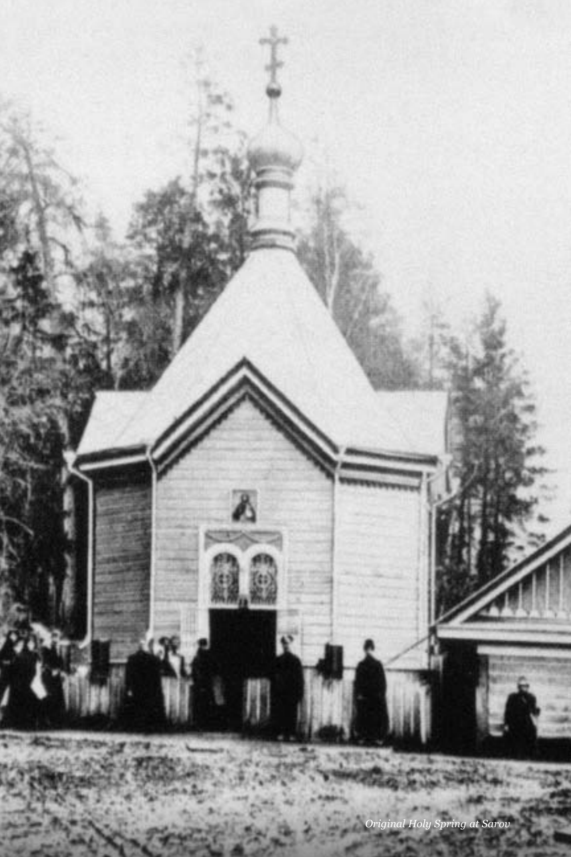
Original Holy Spring at Sarov