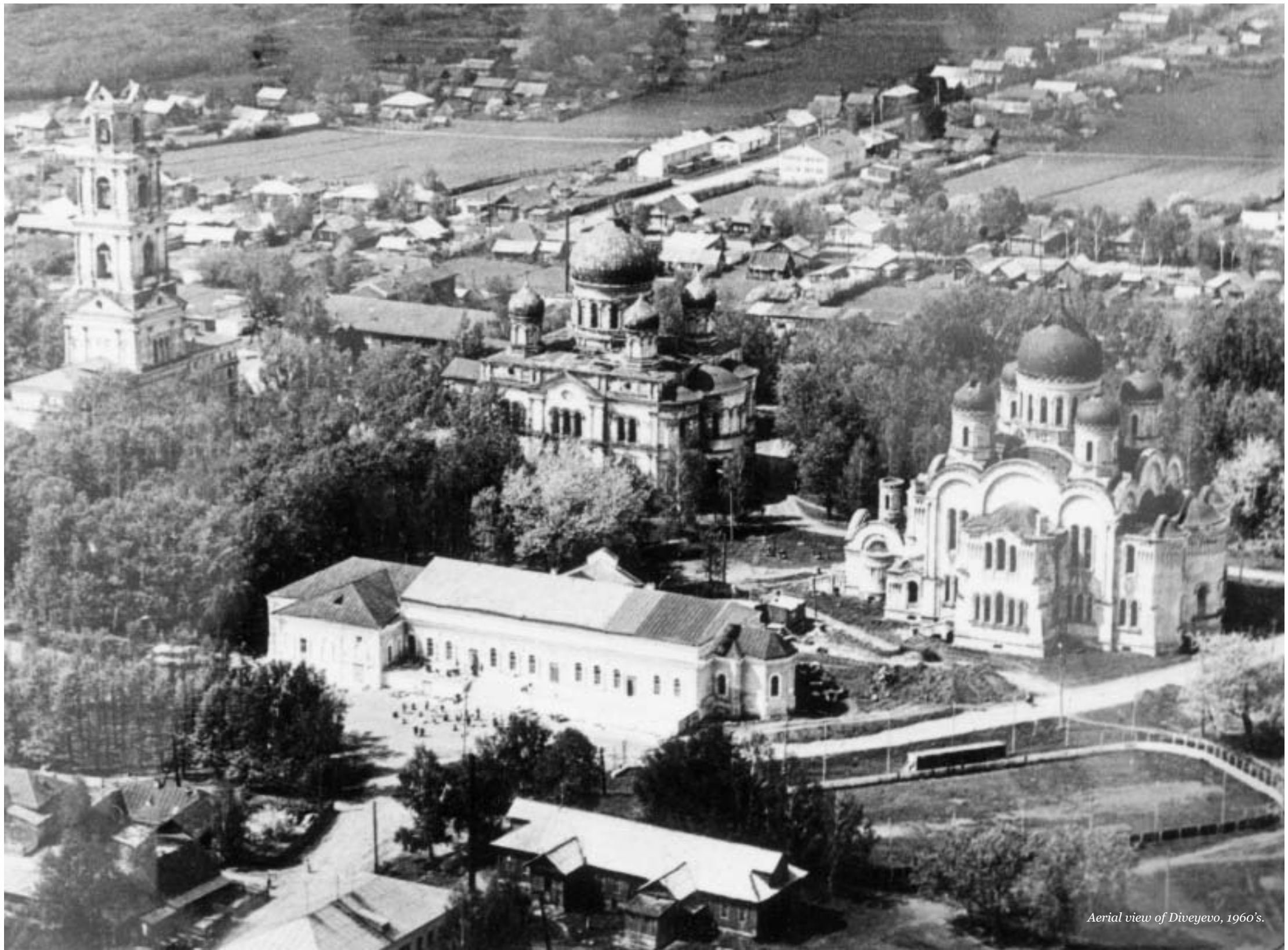
Aerial view of Diveyevo, 1960's.