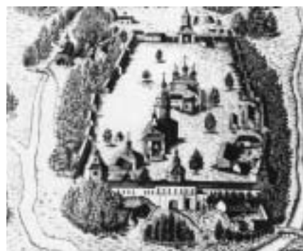
Lithograph of Sarov Monastery, 1784.

authorities secretly moved the relics to St. Petersburg where they were stored for sixty years in a box in the basement of a second museum. After serving as a prison camp and then an orphanage for the children of prisoners, in 1946 Sarov was renamed Arzamas-16 and the monastery used to house the Soviet Union’s nuclear weapons research facilities. Today the village and the monastery buildings are still off-limits to non-villagers and