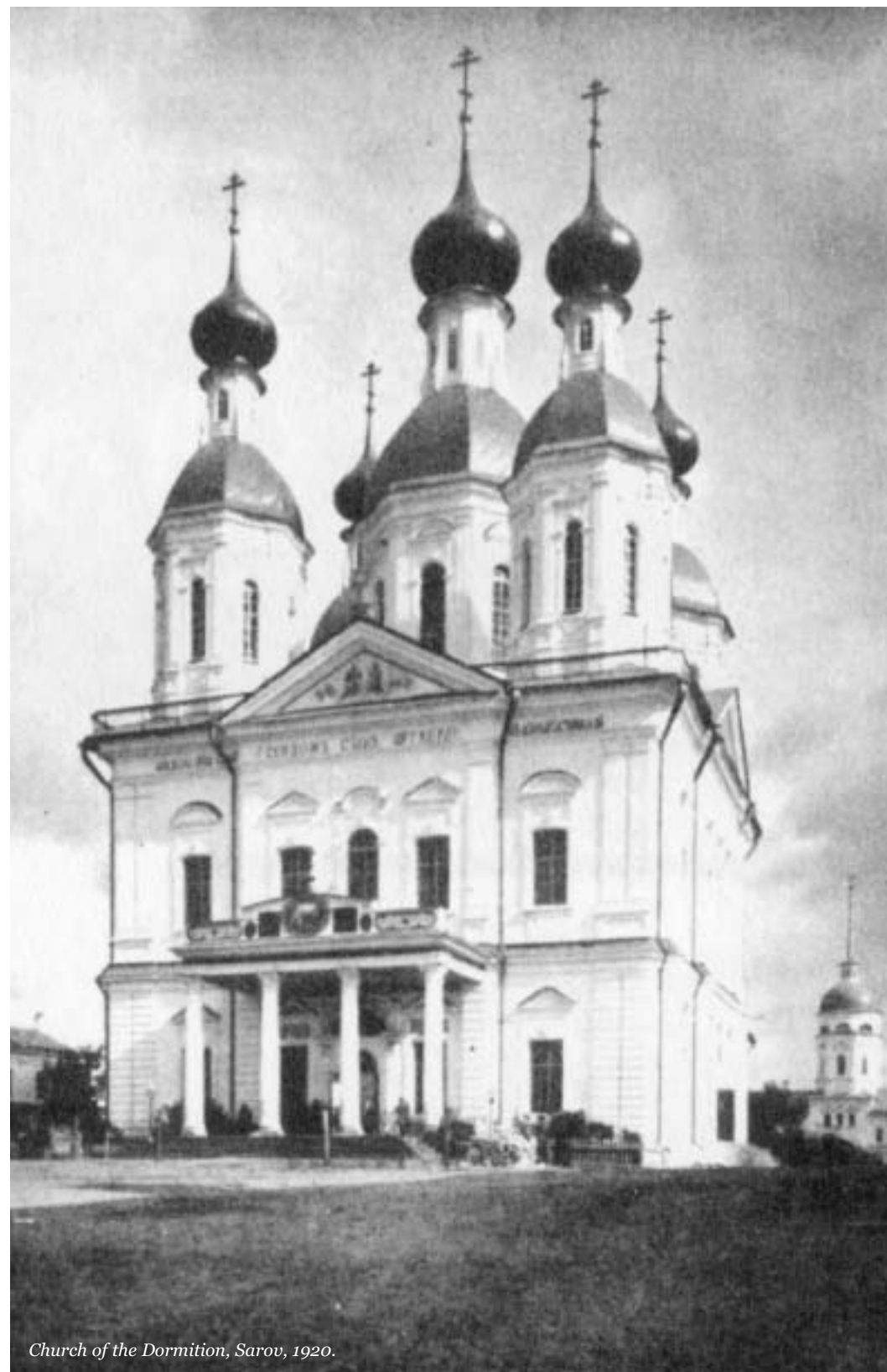
Church of the Dormition, Sarov, 1920.