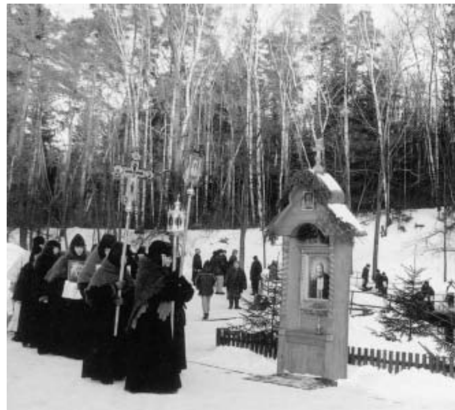
Cross procession to St. Seraphim's Spring near the village of Tsiganovka.

About a half-hour's drive from Diveyevo is a dirt road leading to a narrow footpath that follows the stream bed to its source. The stream is bordered with birches and a variety of low bushes and shrubs. During the summer the forest is filled with wild mushrooms and berries, and the warm damp earth