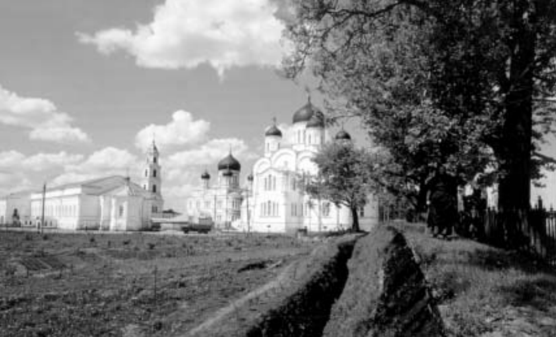
Newly redug kanafka with Diveyevo in background.

Many of the pilgrims look as if they could have lived a century ago. Country women are in long skirts, blouses and scarves. I see several babushki – grandmothers – bent almost double with age, who nevertheless stand motionless through five or six hours of services, except in the intervals when they throw down their canes to make prostrations, helped to their feet after each poklone by their neighbors.