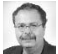
Dr. Tarek Mitri

T here are many Orthodox Christians and Muslims who live with each other as neighbors, and there are times of crisis in their lives where they turn into enemies – but often this enmity comes as a result of a perception that does not necessarily reflect the local reality but the global reality. If we see global reality in terms of confrontation between Christians and Muslims, then our Muslim neighbor becomes a threat to us. There are many cases in which neighbors, living in peace with each other for decades, have seen their relationship deteriorate because of the perception they have of each other's religion, tradition, community, history.