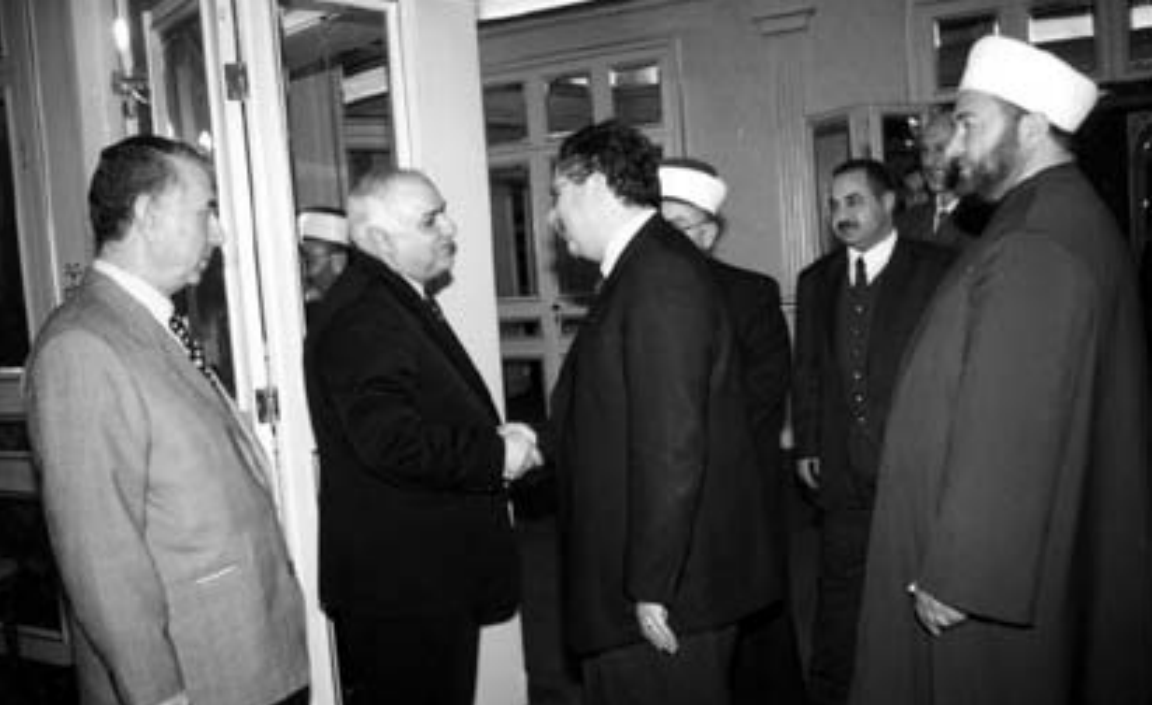
Christian - Muslim conference organized by the Islamic Organization for Education, Science and Culture – Rabat, Morocco, June, 2002.