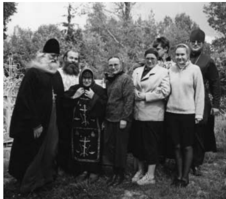
Pilgrims at Yelatma.

Matushka continues, "They also tried to hang me. I had a gold cross that the commandant wanted, but he wanted me to deny my faith so that I would give it to him myself. I wouldn't. It was during the same month that they