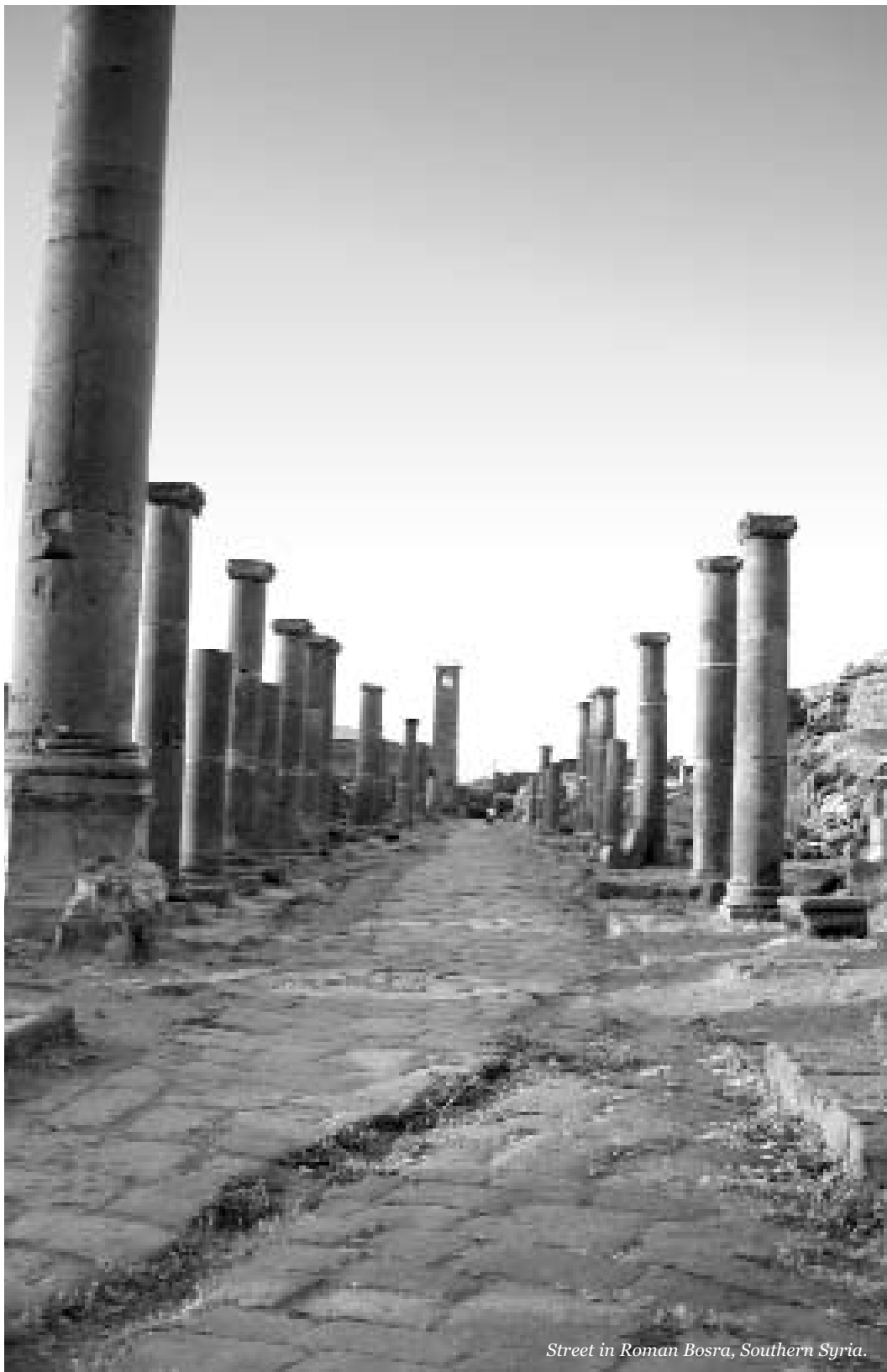
Street in Roman Bosra, Southern Syria.

Jerusalem, Antioch and Constantinople. In 1268 the Muslim Mamluk ruler Baibars destroyed Antioch and the patriarchal see then moved to Damascus (1375-1386).