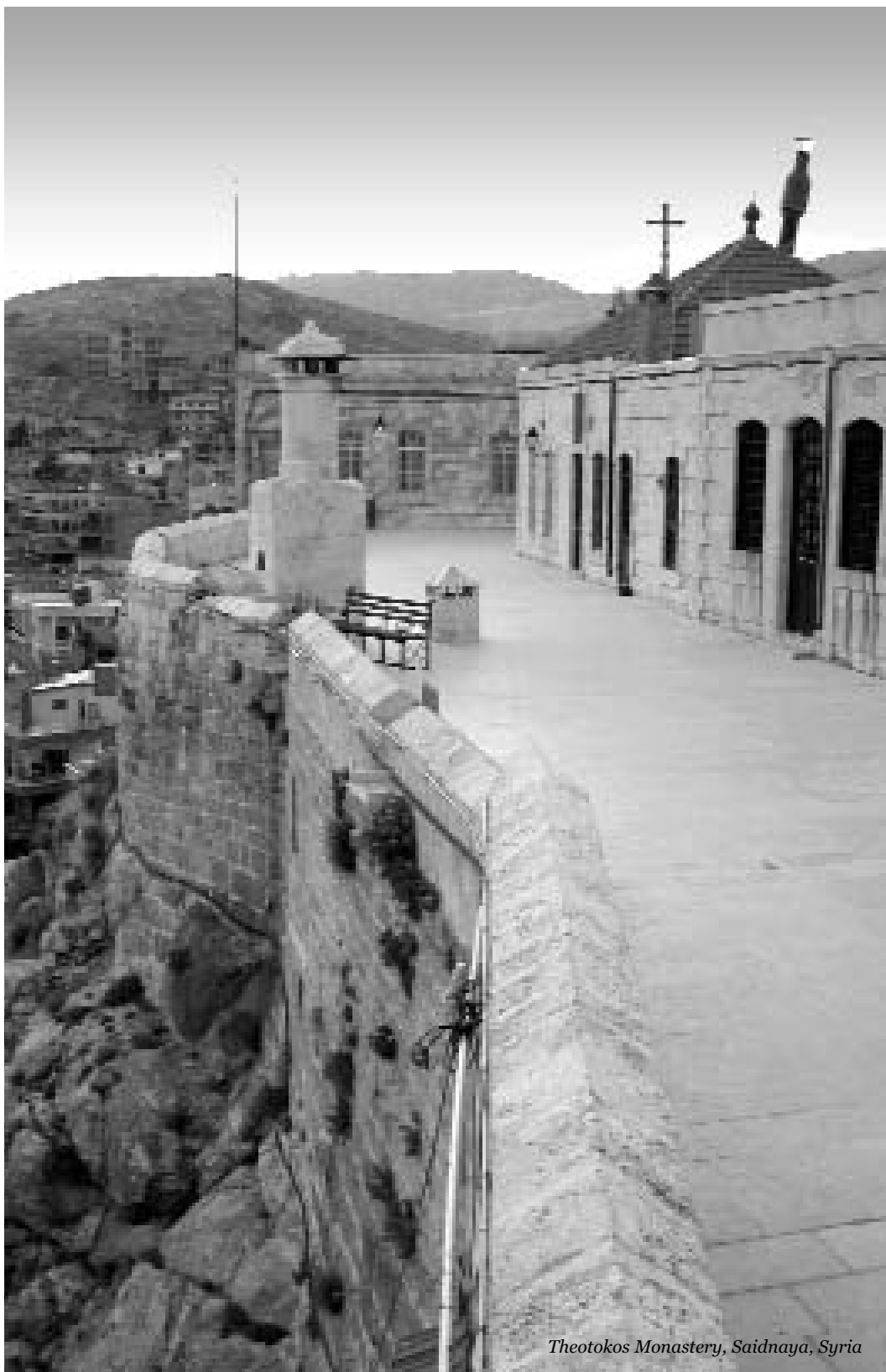
Theotokos Monastery, Saidnaya, Syria

Although he was Bishop of Nineveh for a few months in the Church of the East, he is still widely read in Orthodoxy and considered a saint.