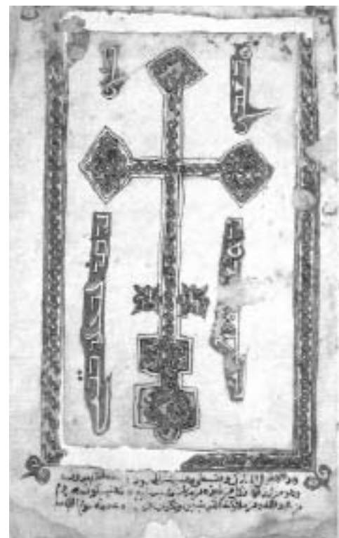
Folio from an Orthodox lectionary, in Syriac, Mount Lebanon, 15th c. – painted Cross with ornaments and decorations. Syriac inscription: "Through you we conquered our opponents and in Your name we trampled down those who rose up against us" (Psalm 44(43):5). (Private Collection)

RTE: Do you have a favourite manuscript?