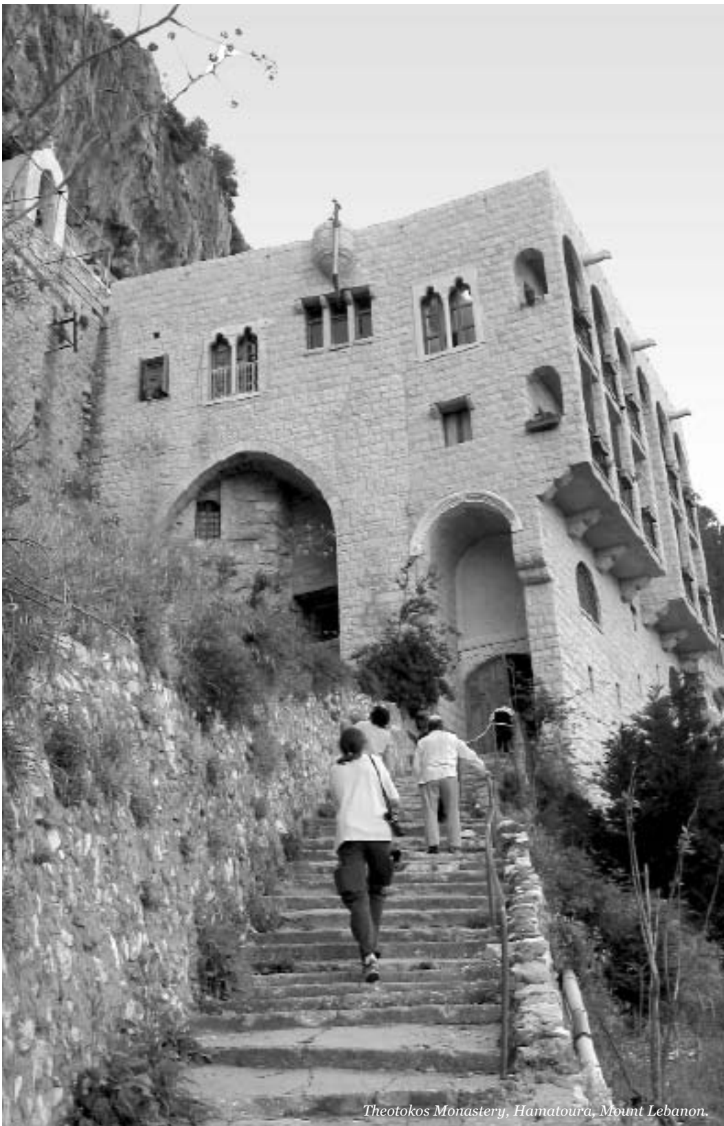
Theotokos Monastery, Hamatoura, Mount Lebanon.