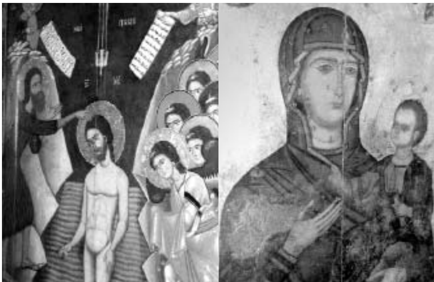
Double-sided icon of Theophany and the Theotokos, Kaftun, Northern Mt. Lebanon.

3rd – In Arabic: on the open scroll that the Prophet David holds, we read a composite text taken from the Psalms 114 [113A]: 3-5 and 77 [76]: 17 [16].