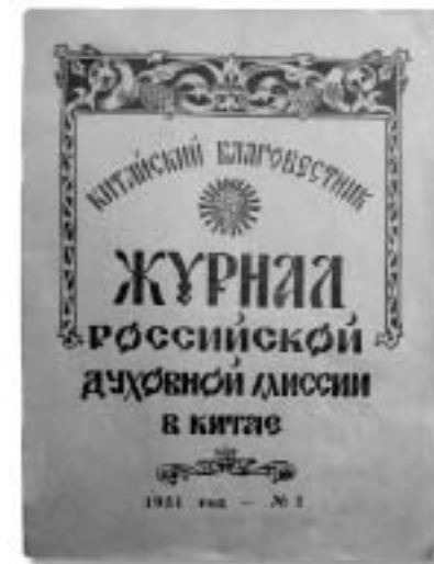
"Chinese Good News," 1951.

In the Russian Institute of Oriental Studies, however, they have Mongolian Orthodox liturgical texts translated over a century ago, so there were Mongolian Orthodox believers. No one is yet able to take up this work in the Mongolian world, but it is a very interesting subject. Mongolia would be very open to it, but we don't have anyone who can speak Mongolian to send. Even in Buryatia, I only know one or two Buryatian priests. They do what they can, but the resurgence of Buddhism is very rapid in Buryatia and Mongolia. It was the tradition of generations and is part of the national self-identification.