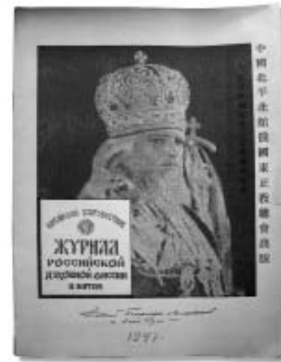
1947 issue of the Moscow Patriarchal journal, "Chinese Good News: Journal of the Russian Spiritual Mission to China."

RTE: In English, we still don't have lexical norms for many church words. We often use Greek or Russian words, when the English equivalent doesn't quite