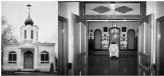
Agios Nikolaos: St Nicholas in Yining (Kuljha), Xinjiang.

RTE: I know that there have been at least two icons painted in a rather Chinese style of the Lord and of New Martyr Mitrophan, which have been distributed by the Greek Archdiocese in Hong Kong. Were these done by a Chinese iconographer, or painted somewhere else?