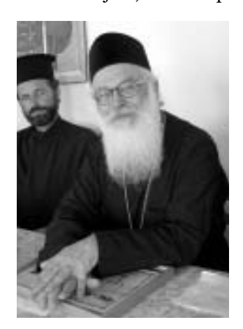
Archbishop Anastasios of Albania

I'm not speaking here about the presence of the Holy Spirit in terms of the sacraments and the working-out of salvation, but when the Lord speaks of the sun shining on the evil and the good, and the rain falling on the just and the unjust, this is a quality of the Holy Spirit that is very indiscriminate,