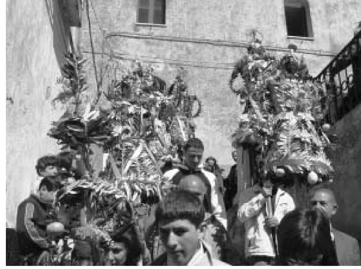
Palm Sunday in Chora tu Vua.

Around 300 B.C., portions of southern Italy were Latinized by the Romans, however, many cities in eastern Sicily, including Catania and Messina remained Greek-speaking, Messina itself until the sixteenth century. Western