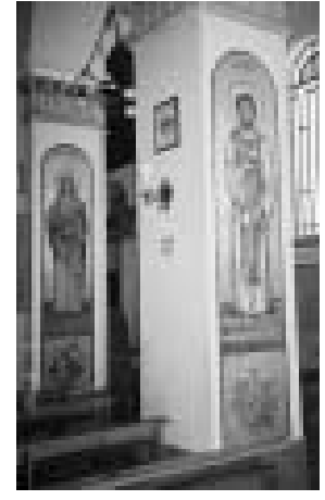
Mosaics of Sts. Leo and Lucia in Calabrian Catholic Church.

The first Greek colonists (700 B.C.) settled in southern Italy from the citystates of Greece and from Asia Minor, but even earlier were the "Mycenaean Greeks," the prehistoric "pre-Hellenes," who entered southern Italy from