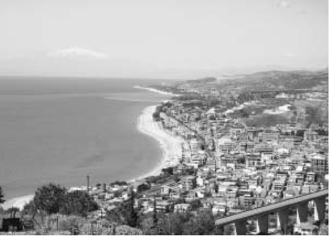
Jalo tu Vua (Bova Marina).

(South Italy). There is speculation that early Latin Gregorian chant was influenced by these ancient tones of Sicily and South Italy, whose people were among the first western Christians.