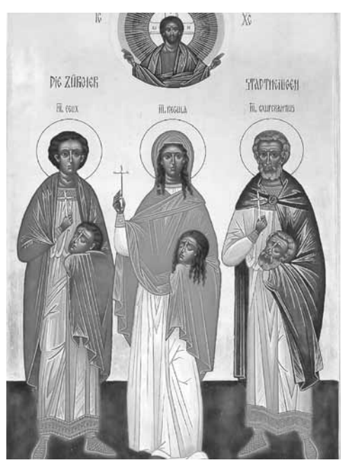
Patron Saints of Zürich, Switzerland. Icon presented to the Grossmünster (Great Minster) by the Orthodox Clergy.

By the way, the Mariastein Monastery is chiefly known as a great pilgrimage place to the Mother of God, to commemorate