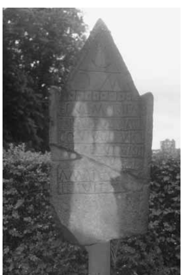
4th-century Roman gravestone showing Christian and pagan elements. Kaiseraugst, Switzerland.

In addition to this sampling of "perfect" places, in some places you can go into a crypt, treasury or other special shrine if you make arrangements in advance. In many places the relics which are usually in safekeeping are brought out in procession and for veneration on the saint's feast day. Other places, such as the town of Scheer, have shown that it is possible to keep their treasures safe and still provide for everyday devotion. There, they have beautiful duplicates in the church of the three reliquaries for the Anglo-Saxon sibling saints which they possess. The relics, however, are in a room directly behind the wall in their original reliquaries. The originals are brought out on their feast days.