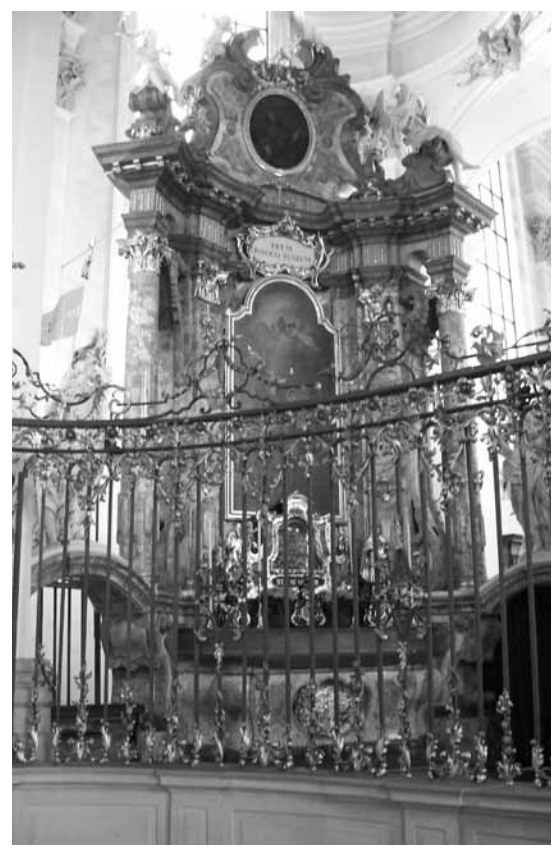
Relics of Sts. Gall, Otmar, and other saints behind ironwork in Cathedral of St. Gall, St. Gallen, Switzerland.

For example, in Bregenz (now Austria) we can trace the replacement of Christianity by pagan worship. When missionaries arrived there two centuries after the Roman troops had left, they found a church that was previously dedicated