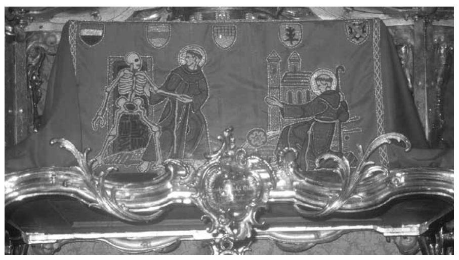
St. Fridolin's shrine: legend of raising the dead man Urs. Bad Säckingen, Germany.