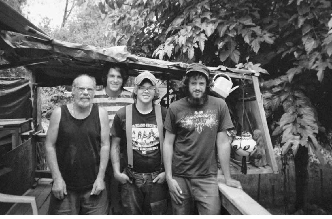
Camping in the South.

of the Church in your mind and feel yourself to be part of the cycle of the Church year, those deep services give a stability and community outside of yourself.