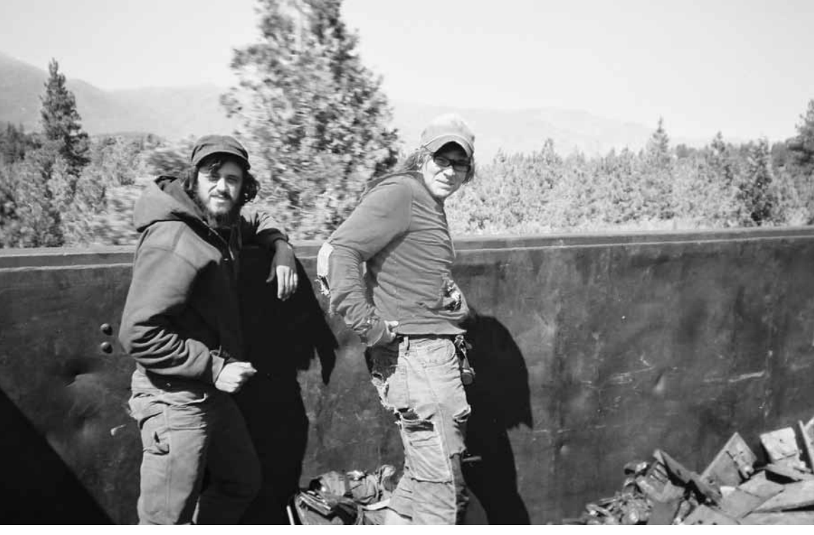
Young travelers northbound.

SETH: There's an even bigger community of Christians who used to travel, or who want to travel and haven't been able to yet, or people who are simply friends with travelers. When you go to their town, you know you can stay with them. Once you start traveling, you learn to spot other travelers immediately, even in a big city. They'll have coveralls or patched-up clothes with neutral colors of green and brown. You're already friends at the first meeting; you share your squat, your food, and help each other out any way you can. There's a camaraderie here that you don't have with most people, which was something I began to find with some Orthodox folks as well. You can't fake that and you can't buy it. I have to say though, that I've pretty much stopped traveling with the Protestant Christian travelers, because they tend to have a mistaken, negative view of Orthodoxy.