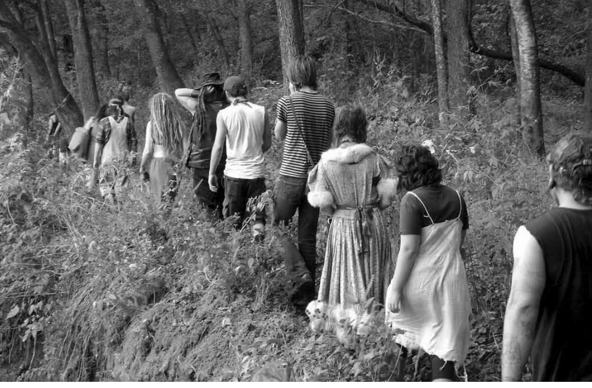
Travelers meeting in the woods.

RTE: How would you contrast the Christian traveler scene with that of the American Christian world in general?