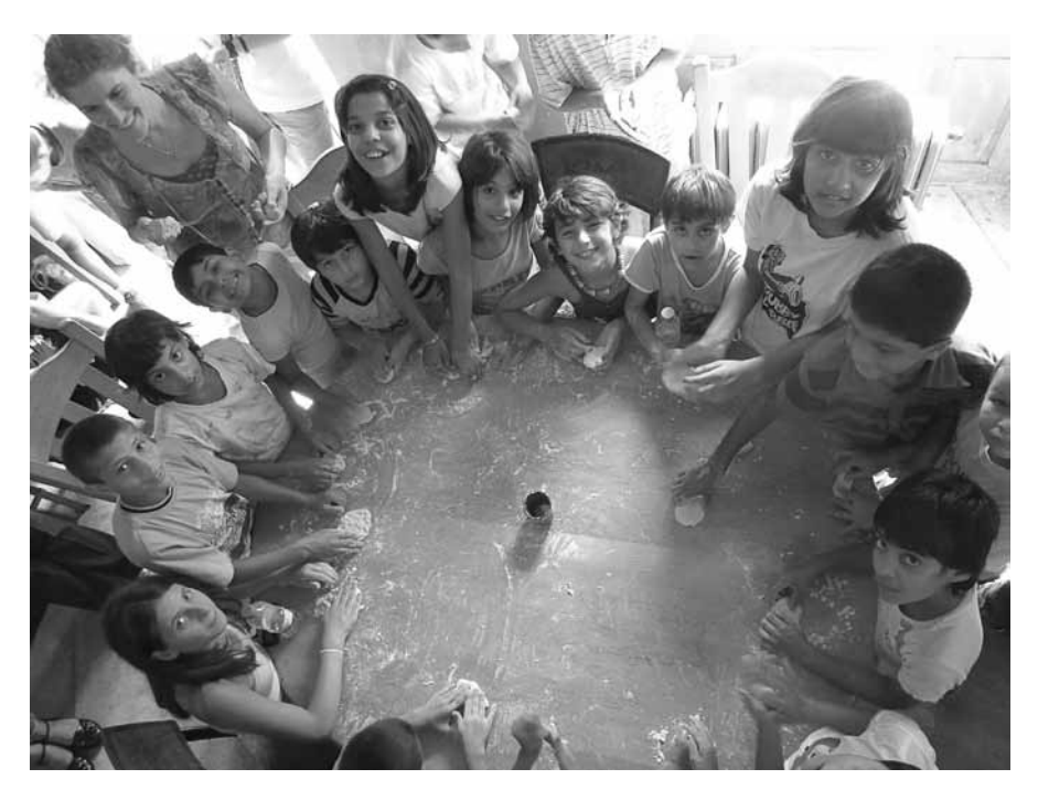
Gabrovo, Bulgaria. Friday community bread-making that allows orphans to build friendships with local families, 2010.

NADEZHDA: Yes. When I say that love is made tangible through bread, I mean it literally because when the bread comes out of the oven it is different for different people. Interestingly, the childrens' breads always come out best. They come out soft and gorgeous, and they don't even know how to knead; their bread is usually just a bunch of dough lumps all clumped together, often with too much added flour. According to any baker's standard for technique this bread should not turn out right, but the kids' breads are always the softest and the sweetest. I've had some adults who kneaded their