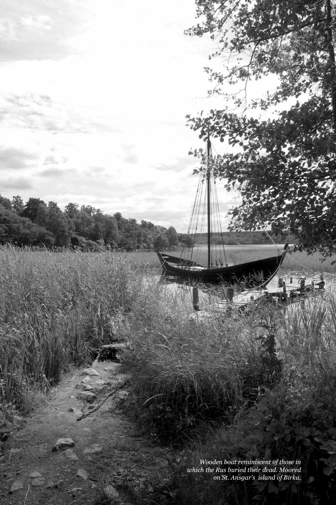
Wooden boat reminiscent of those in which the Rus buried their dead. Moored on St. Ansgar's island of Birka.