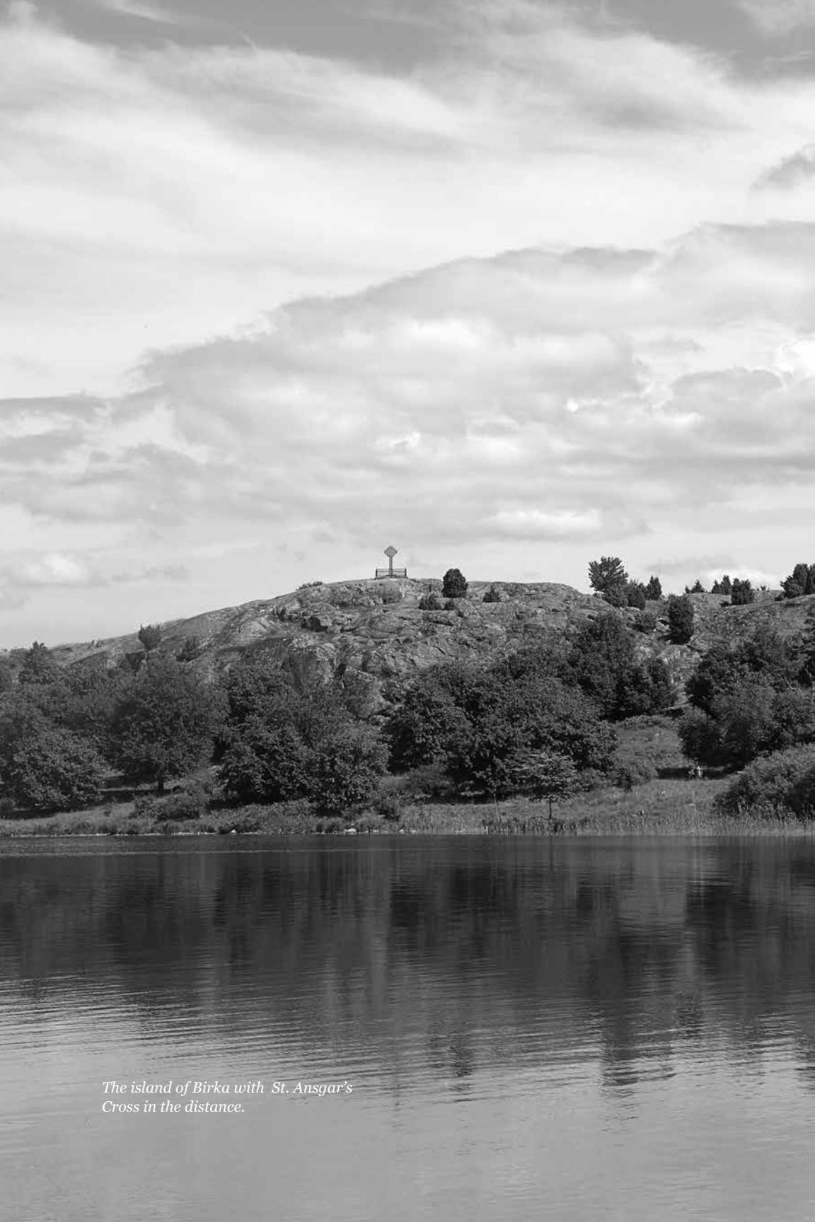
The island of Birka with St. Ansgar's Cross in the distance.