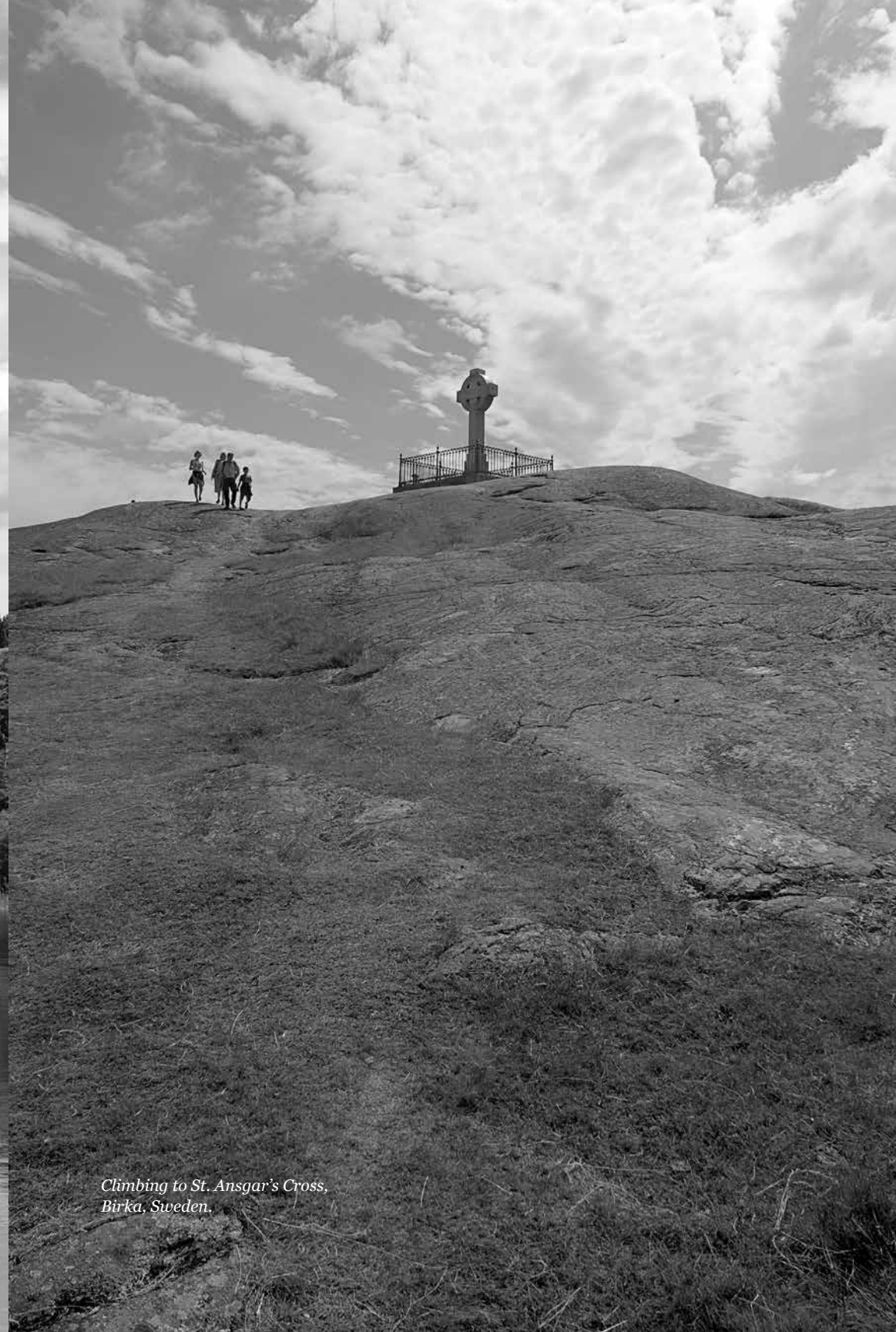
Climbing to St. Ansgar's Cross, Birka, Sweden.