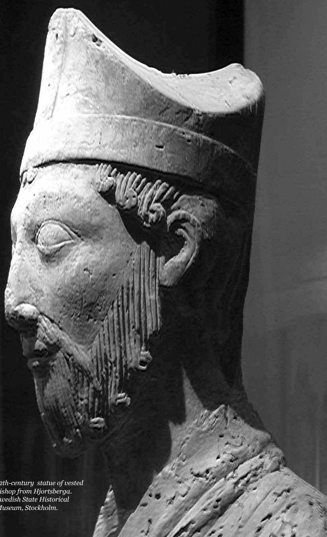
12th-century statue of vested bishop from Hjortsberga. Swedish State Historical Museum, Stockholm.