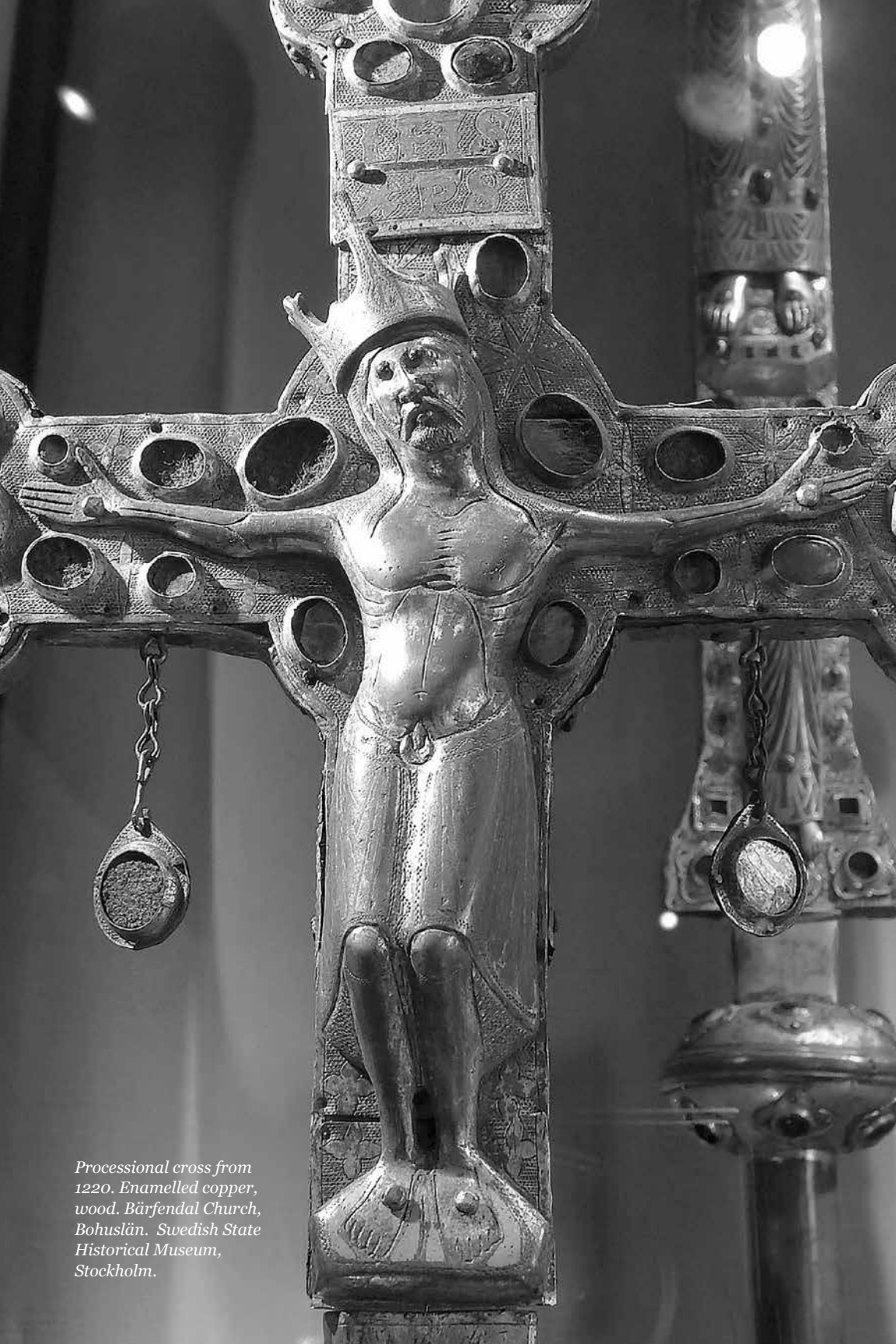
Processional cross from 1220. Enamelled copper, wood. Bärnfendal Church, Bohuslän. Swedish State Historical Museum, Stockholm.