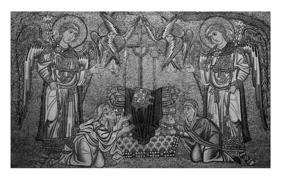
Mosaic of Adam and Eve kneeling before the Cross, Torcello Cathedral, Venice, Italy.

the other because it is not willing to pay the full cost of loving. At a certain point we simply discard the victim of our self-love. Without agape, eros remains stunted, partial—finally it collapses and isn't even eros; the fire goes out and all that remains is the original concern with the self. Such eros has never risen above self-love.