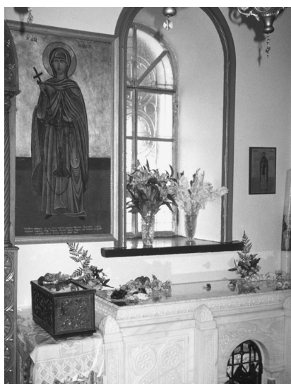
Relics of St. Olympiada (in small reliquary) and sepulchre of New Martyr Deacon Nicholas.