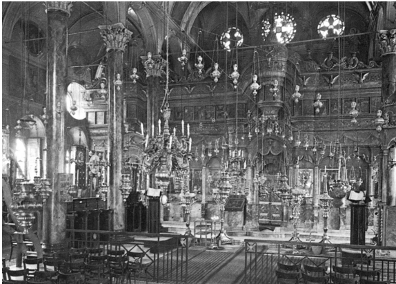
Church of Agiassos.

In 1795, twenty-one-year-old Fr. Theodore, dressed as a Turk, left for Mitilene with another monk. After he said farewell and took a final blessing from his companion, he went to the Turkish magistrate, took off his fez and threw it to the ground, saying, “You made me believe in Mohammed and leave Christ. Now I give you back your Mohammed and I take to myself my belief in Christ.” The magistrate told him that he was mad, but the monk replied, “I am not mad. I was born a Christian and I will die a Christian. My name is not Mohammed but Theodore.” He was finally imprisoned, shackled by the arms and neck, and harshly beaten. A few days later the authorities again sum-