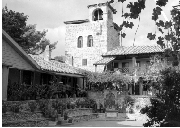
“Taxiarches”—the Church of St. Michael in Mantamados.

The feast of the icon of St. Michael is celebrated on November 8, the Synaxis of the Bodiless Powers, and September 6, the Miracle at Colossae.