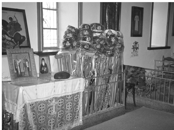
Left: The rock on the table was found under St. Raphael's head in the grave. Middle: crutches left by healed believers, and hats left by military men.