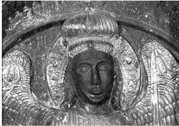
Detail of the clay icon of St. Michael the Archangel.