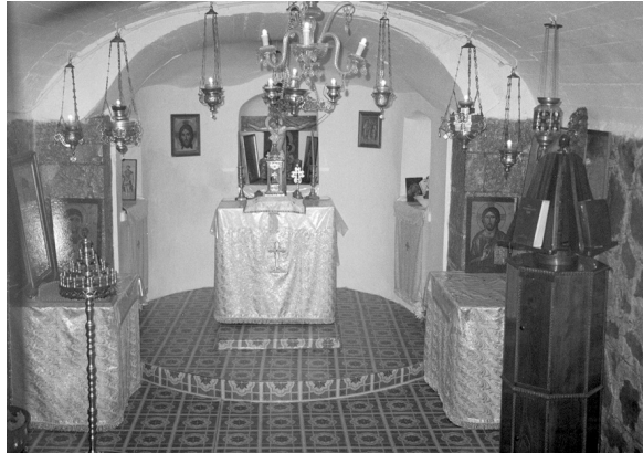
Chapel over the site where St. Raphael's relics were found.

I would die. Having read about St. Raphael in an Athenian newspaper, I went to the monastery and venerated the saint's relics. I begged him to heal me, but, at that time, I was not made well. I believe this is because I had not been particularly religious – I had not confessed or received Holy