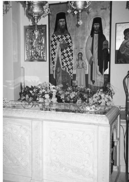
Relics of St. Irene.