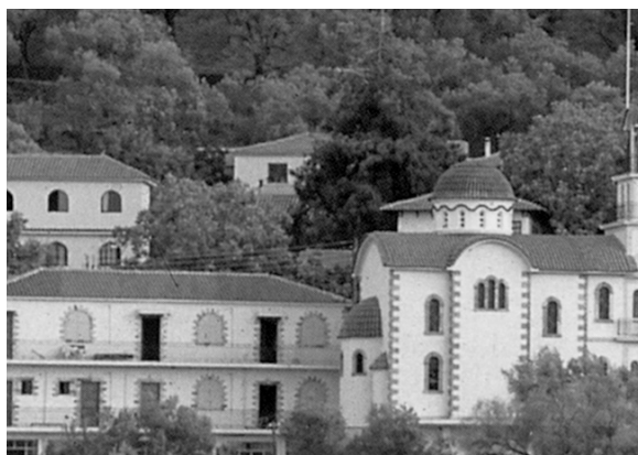
Monastery of St. Raphael.

Karyes (in former times “The Panagia of Karyes”) the spot was well known to the residents of Thermi. Sheep had been pastured there for centuries near a small chapel surrounded by scattered hewn stones that testified to the early presence of a monastery. Often, a beautiful fragrance was reported on the hillside, and there was a centuries-old custom among the local Christians of gathering there with lighted tapers on Bright Tuesday for liturgy. The reason for celebrating the liturgy in the little hill-chapel had long been forgotten, but the tradition was faithfully kept, spurred on by centuries of reports by local shepherds and villagers of the appearance of an unknown monk, sometimes with a censer in hand, who disappeared at their approach in a cloud of radi-