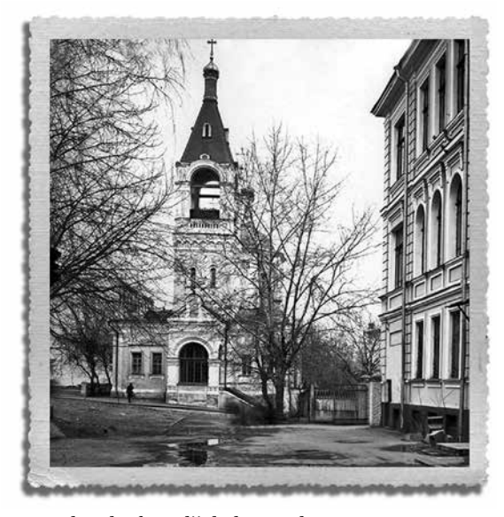
Church of St. Elijah the Prophet.

One morning, instead of attending a first-year lecture on the history of the Communist Party at Moscow State University, I had a sudden urge to