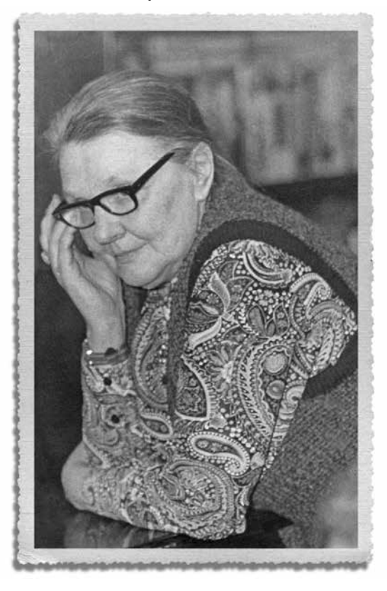
Granny in her last years.

That was my first night without sleep. Of course, one cannot put down on paper everything that crowds a fifteen-year-old schoolboy's mind and heart, but as I watched the day dawn and cried out the remnants of my hardness of heart towards my grandmother, she