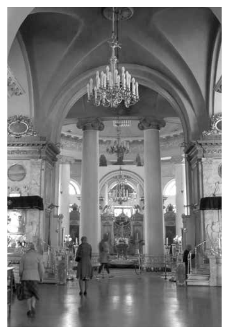
Main altar of the Church of the Transfiguration on Bolshaya Ordynka Street.

I recall an incident around this time (probably 1968) involving the place where we stood during the Pascha service, a cozy spot that was close to the choir directed by my grandmother's friend. People with bright, cheerful faces prayed around us, the choir glorified Christ's resurrection as if they were but one voice, yet I stood there fearful. It seemed to me that some of