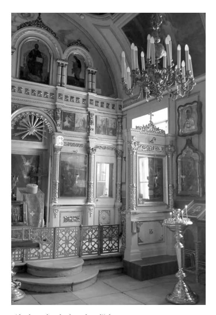
Side altar. Church of Prophet Elijah, Moscow.